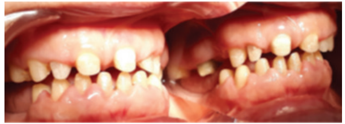
Figure 4. Intraoral view after preparation of teeth

In the following sessions, metal substructures of fixed restorations (Kera N, Dr.-Konrad-Wiegand-Str. 9 - D-63939 Wörth, Germany) were performed (Figure 5) and the trial of ceramic restoration (Ceramco 3, Dentsply, Dreieich, Germany) was accomplished with minor occlusal adjustments. The final restorations were glazed and cemented with zinc polycarboxylate cement (Adhesor-Carbofine, Spofa-Dental, Germany). At the session three days later, a second impression of the mandibular removable denture was taken with alginate impression material. The metal framework of the lower denture and tooth alignment was performed in the following sessions. Then acrylic removable mandibular denture was adjusted in the patient's mouth. The occlusal scheme of definitive restoration was designed as group functional occlusion (Figure 6). The patient was advised to maintain oral hygiene and schedule regular check-ups every six months. Written informed consent was obtained from the patient for the publication of her data.