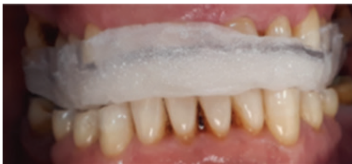
Figure 14. Maxillary occlusal splint