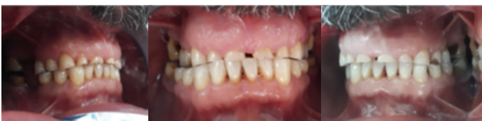
Figure 12. Intraoral view before treatment

A 62-year-old male patient applied to the prosthodontic clinics with complaints of poor aesthetics of anterior teeth. The patient had an apparent worn upper anterior teeth with missing teeth (16,26,36,47) (Figure 12). The plaque accumulation has been examined. The patient did not have any dysfunction in the TMJ evaluation. For the rehabilitation of worn anterior teeth and rehabilitation of posterior missing teeth, upper full mouth restoration (11,12,13,14,15,16,21,22,23,24,25,26,27) and fixed partial bridge restorations for lower missing teeth were planned (45-46-47, 35,36,37). The patient was informed about the potential restorative treatment option and all the advantages, disadvantages and possible risks of treatment have been explained.