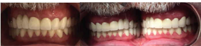
Figure 11. Intraoral view of final restoration