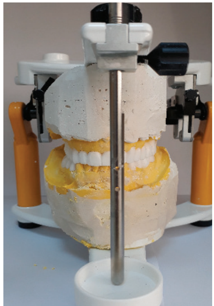
Figure 13. Diagnostic wax up

was decided that the OVD should be increased by 4 mm in the anterior teeth. Following the aesthetic approval by the patient, to evaluate the neuromuscular adaptation to the planned OVD increase, an occlusal splint was prepared (Figure 14). This was used by him for 4 weeks and finally, no muscle tenderness and temporomandibular discomfort were noted. After the functional adaptation to the new OVD, upper and lower teeth were prepared to receive full metal ceramic crowns. The second impressions were obtained and provisional auto-polymerized acrylic resin restorations were prepared and placed. Then, definitive metal (Kera N, Germany) supported ceramic restorations (Ceramco 3, Dentsply, Dreieich, Germany) were fabricated and adjusted in canine guided occlusion (Figure 15). After the glazing procedure, the restorations were cemented (Figure 16). Written informed consent was obtained from the patient for the publication of his data.