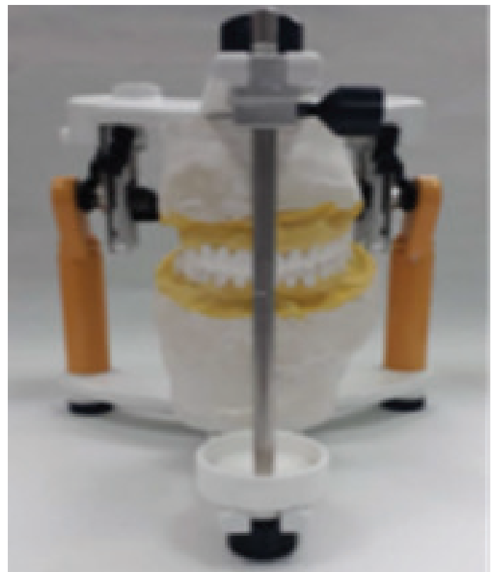
Figure 8. Diagnostic wax up

by the patient. The preparation of all anterior and posterior teeth (Figure 10) was completed, and second impressions were made with polyvinylsiloxane impression material (Optosil Comfort/Xantopren VL Plus, Heraeus Kulzer, Hanau, Germany) and provisional self-cured acrylic resin restorations were inserted. In the next sessions four days the metal substructures (Kera N, Germany) and ceramics (Ceramco 3, Dentsply, Dreieich, Germany) of fixed restorations were adjusted (Figure 11). The definitive restorations were glazed and cemented with zinc polycarboxylate cement (Adhesor-Carbofine, Spofa-Dental, Germany). The group functional occlusion was established. The patient was satisfied with the improved aesthetics and also the function of dentition. Written informed consent was obtained from the patient for the publication of his data.