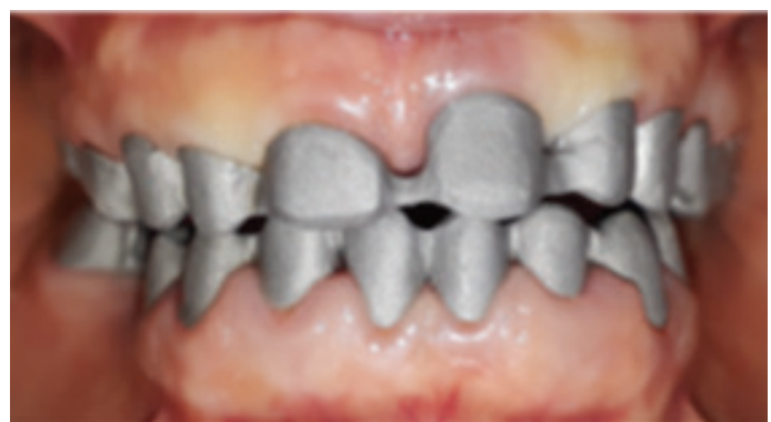
Figure 5. Metal substructure

In the following sessions, metal substructures of fixed restorations (Kera N, Dr.-Konrad-Wiegand-Str. 9 - D-63939 Wörth, Germany) were performed (Figure 5) and the trial of ceramic restoration (Ceramco 3, Dentsply, Dreieich, Germany) was accomplished with minor occlusal adjustments. The final restorations were glazed and cemented with zinc polycarboxylate cement (Adhesor-Carbofine, Spofa-Dental, Germany). At the session three days later, a second impression of the mandibular removable denture was taken with alginate impression material. The metal framework of the lower denture and tooth alignment was performed in the following sessions. Then acrylic removable mandibular denture was adjusted in the patient's mouth. The occlusal scheme of definitive restoration was designed as group functional occlusion (Figure 6). The patient was advised to maintain oral hygiene and schedule regular check-ups every six months. Written informed consent was obtained from the patient for the publication of her data.