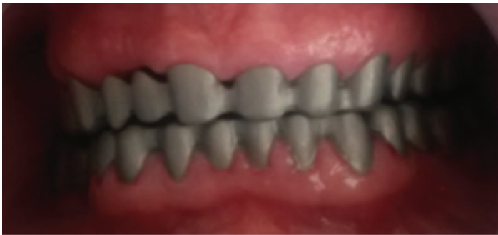
Figure 10. Metal substructure