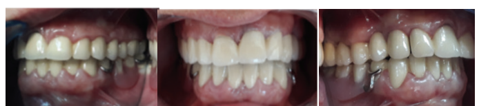
Figure 6. Intraoral view of final restoration