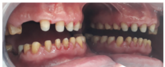
Figure 9. Intraoral view after preparation of teeth