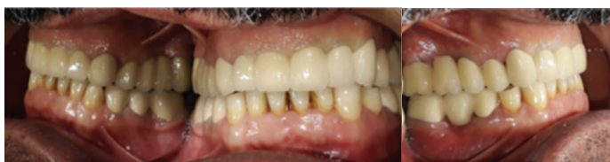
Figure 16. Intraoral view of final restoration