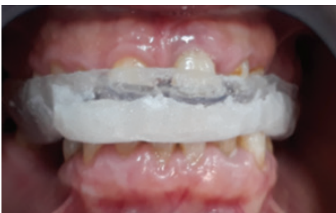
Figure 3. Maxillary occlusal splint