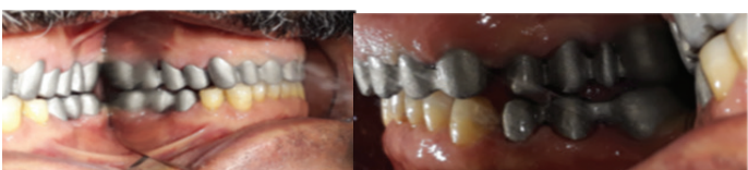
Figure 15. Metal substructure