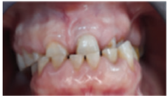
Figure 1. Intraoral view before treatment

extraoral clinical examination, a reduced lower face height was noted. Dental examination showed a generalized worn dentition, diastemas in anterior teeth, and missed teeth numbers as; 24,26,35,36,37,45,46 (Figure 1). TMJ evaluation revealed no history of dysfunction, no joint sound, and pathology. Masticatory muscle, and head and neck muscles were normal at palpation. The mandibular range of the motion and jaw opening were within the normal limits.