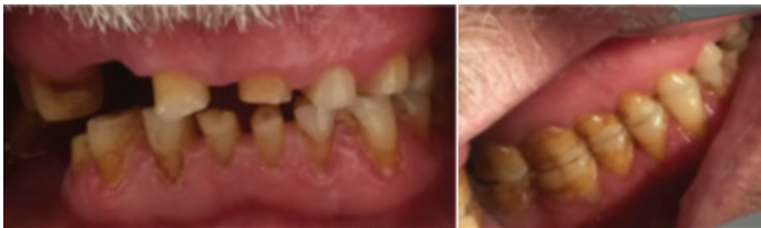
Figure 7. Intraoral view before treatment

A 77-year-old male patient was referred to the clinic with the chief complaint of poor aesthetics, a generalized worn dentition, and missing teeth (12,13,16,17,46) (Figure 7). The patient has a history of bruxism and is wearing a night guard to prevent attrition of dentition. In the periodontal examination, generalized stainings and calculus were observed on teeth. Supragingival scaling was performed to remove plaque and calculus and then polishing was applied. TMJ evaluation showed no history of dysfunction, no joint sound, and pathology. Masticatory, head and neck muscles were normal to palpation. The mandibular range of the motion and jaw opening were within the normal limits.