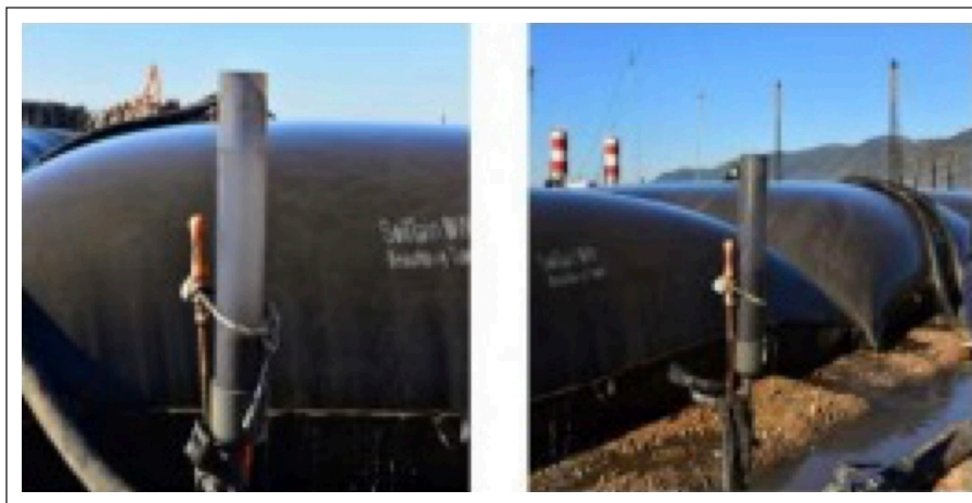
Figure 4. Flocculation instantaneous control.

Given that the volume of solids in the tubes rose once they reached a height of one meter, compaction was performed on the sludge tubes with a compactor to prevent the clogging of the pores where the sludge filtering took place and to ensure better water drainage. The filling and compaction process of the tubes was continued until the maximum height reached 2.10 m. When the height of the sludge tube reached the maximum level, the process of pressing material into the tubes was terminated, and the tubes were left to wait for 10 days for final filtration. During the final waiting period, samples were taken daily from the filling chimneys in the tubes and checked. When the samples taken at the end of 10 days were examined, it was seen that the material in the tubes was suitable for transportation. When the tubes became suitable for transportation, they were cut and opened, controlled with a