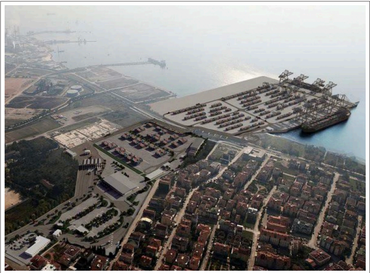
Figure 5. Completed Yarımca container terminal project.

Since geotextile dewatering tubes are "disposable" materials, the remaining tube residues were disposed of according to local regulations after the processed sludge was transported in a way that would not pollute the environment.