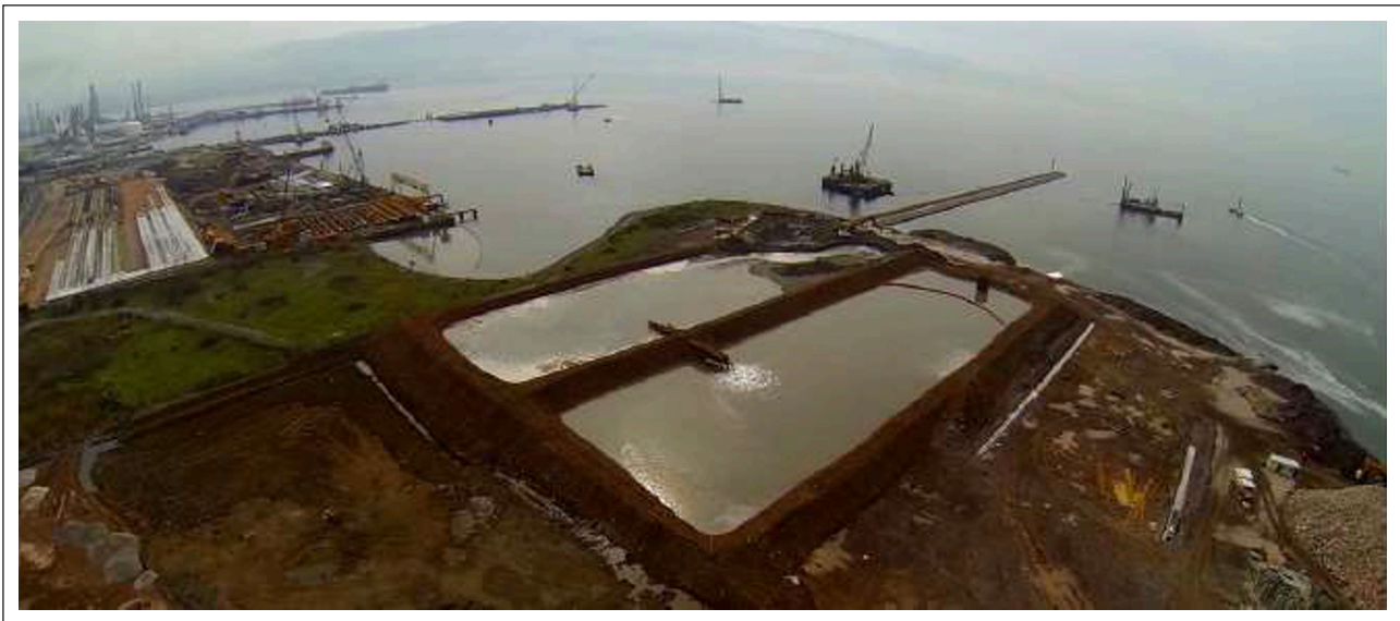
Figure 2. Overview of application 1.

Before the construction of the small pool was completed, 12 pipes were placed at three different elevations to provide a connection between the two pools. The upper width of the area, which is 620 m in length, was manufactured as 7 meters. The total material dredged from the floor of this area was 35888 m 3 . An overview of Application 1 can be seen in Figure 2.