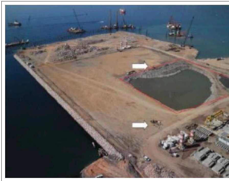
Figure 3. Reclamation area ground improvement – overview.