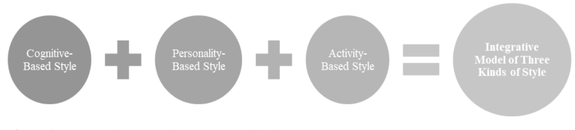
Figure 1. Grigorenko & Sternberg (1995) style classification

The theoretical framework of this study is based on the classification made by Grigorenko and Sternberg (1995)- which is one of the most widely accepted classifications. Zhang and Sternberg (2005) refer to it as "integrative model of three kinds of style" (Figure 1). The classification includes types of styles which emphasise personality, mental processes and learning-based activities and also various dimensions of them. Therefore, this current study analyses it categorises the analyses on the basis of Grigorenko and Sternberg's style classification- one of the integrative classification model.