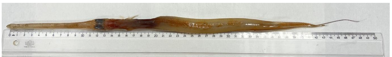
Figure 2. The red cornetfish, Fistularia petimba Lacepède, 1803.

The hepatosomatic index (HSI) was calculated as HSI=100 \times \text{Liver weight} / \text{body weight} (Sulistyo et al., 2000). For the gonadosomatic index (GSI) of mature specimens, the formula GSI= \text{Gonad } W \text{ (g)} / \text{total } W \text{ (g)} \times 100 was used, along with the Fulton-K= (100 \times Wt) / L^3 equations (Ricker, 1979). Depending on the weight of the consumed food, the stomach fullness index (FI) was calculated as FI= \text{Full gut } W / W \times 100 (Hureau, 1969), and the visceral index (VSI) was calculated as VSI = \text{all internal organs } W / \text{body } W \times 100 (Cheng et al., 2005) Encephalization quotient EQ= \text{Brain } W \text{ (mg)} / (W)^{2/3} (Pauly et al., 2011). The relative gut length (RGL) and TL relationship were evaluated according to Zar (1999). In the obtained values, RGL<1 represents carnivorous feeding, 1<RGL<3 represents omnivorous feeding, and RGL>3 represents herbivorous feeding (Karachle and Stergiou, 2010). The obtained data was evaluated using the Statistica package program. The student-t test was used to evaluate index values and determine the statistical difference between sexes. All statistical differences were evaluated according to p<0.05 .