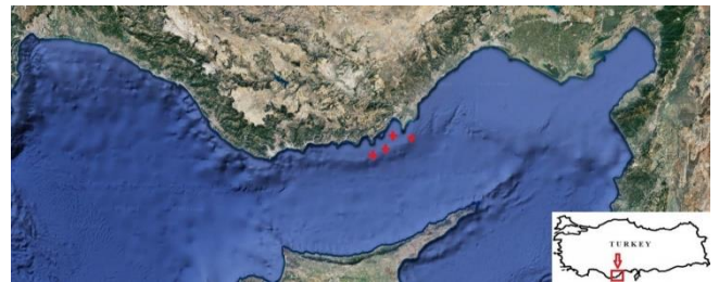
Figure 1. The sampling areas along the coastal area of Mersin province (fishing ground between Narlıkuyu and Yeşilovacık in Silifke) in the eastern Mediterranean, Türkiye

The weights of the internal organs were measured separately to determine the following indices: VSI index, HSI index, GSI index, EQ Encephalization Quotient, and FI index. Additionally, the relative gut length (RGL) was used to determine the Zihler’s index. To determine the length-weight relationship, the equation W=aL^b (Pauly, 1983) was used, where W represents the body weight in grams, L represents the length in centimetres, a represents the intersection point, and b represents the slope. After converting the data to \log_{10} , the values of a and b were determined. While b=3 indicates isometric growth, values other than 3 represent allometric growth ( b<3 negative allometry and b>3 positive allometry).