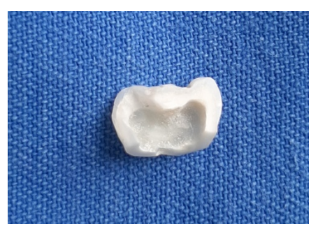
Figure 1. Sample with dentin tissue removed

After extraction, the soft tissues surrounding the teeth were removed. These extracted teeth were kept in isotonic serum solution until the study period. 64 deciduous teeth were removed from the solution and dried separately. The teeth are divided mesiodistal by diamond disc. Dentin was removed with the aid of a round diamond bur. (Figure:1)