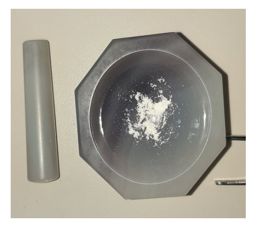
Figure 2. Grinding of enamel samples with agate mortar

A fine powder was obtained by grinding the remaining enamel parts using an agate mortar and a pestle. (Figure:2) The particle size of the obtained powder was standardized with the help of a 120 mesh sieve. (Figure: 3) Approximate 5 g of enamel powder was obtained from 64 primary teeth.