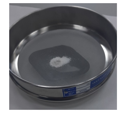
Figure 3. Enamel powder standardized by sieve

Enamel powder weighing 250 mg was added one by one to 5 mL individual pediatric syrup solutions and mixed with the Dlab MX-S Vortex mixer in Hatay Mustafa Kemal University Technology and R&D Application and Research Center for approximately 2-3 minutes until the solutions were homogenized. In parallel with other studies in the literature; it has been maintained for three time intervals of 1 minute, 10 minutes and 8 hours. For each mentioned time interval, the mixtures were centrifuged at 6,000 rpm for 20 minutes with a Weightlab WN-CMV6000 Microcentrifuge device and the pellet and supernatant were separated from each other. The pellets were discarded and the supernatants were stored at +4 ^{\circ} C for further analysis. The samples brought to room conditions were prepared for incineration with a microwave oven. The samples were subjected to