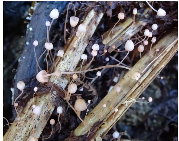
Figure 1. Basidiocarps of Mycena pterigena .

Macroscopic features: Pileus 2-4 mm across, cylindrical when young then conical to campanulate, slightly sulcate, translucent-striate, glabrescent to somewhat pruinose, pale salmon to pale pink, somewhat pale brownish at the centre. Flesh membranous, odor mild. Lamellae broadly adnate, decurrent, whitish to pale rose. Stem 10-35 × 0.2-0.3 mm, cylindrical, threadlike, concolorous with the cap or paler when young, then becomes transparent and grayish brown when mature, thicker at the base or somewhat bulbous (Fig. 1).