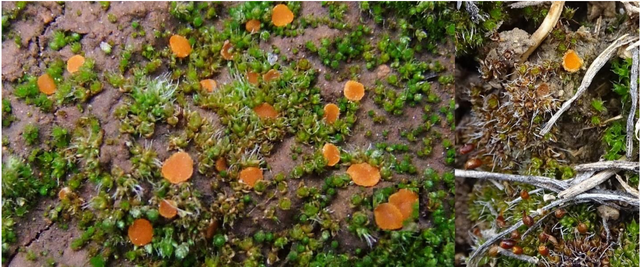
Figure 1. Ascocarps of Octospora itzerottii .

The authors would like to thank TÜBİTAK for supporting the project (212T112) financially.