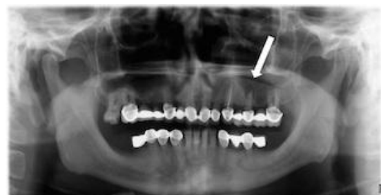
Figure 1. White arrow shows the left premolar tooth with radiolucent apical lesion, which caused left buccal abscess formation.