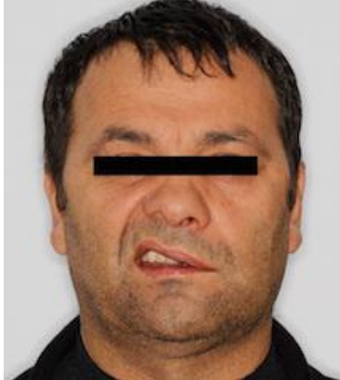
Figure 3. The patient was not able to smile and whistle. (published with the patient's consent)