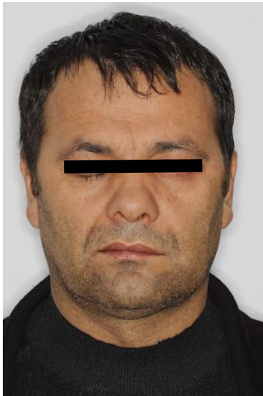
Figure 4. When the patient closes the eyelids, the Bell's sign was observed. (published with the patient's consent)