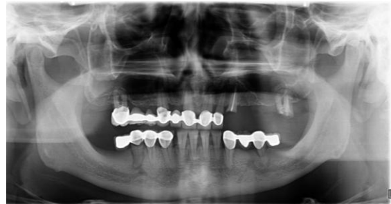
Figure 7. Postoperative radiographic image of the patient. White arrow shows the extraction socket after 3 years of follow up