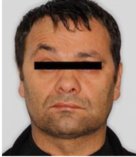
Figure 2. The patient was unable to elevate the left eyebrow in facial nerve motor function examination. (published with the patient's consent)