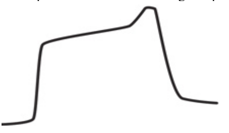
Sudden drop: Airway vehicle misplacement, Cardiac arrest

Obese patient with decreased lung compliance: