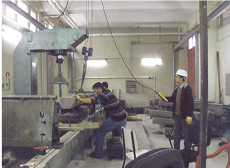
Figure 2 - A sleeper being carried to its position in the beam-loading machine (The other sleepers in stack waiting for their turns to be tested).

computations are given in [8]. The result of the theoretical analyses indicated an ultimate load of 2P = 85 kN for the loading configuration applied during the flexural experiments [8].