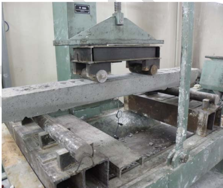
Figure 3 - A sleeper placed in the beam-loading machine in a two-point-loading position at the onset of the experiment.