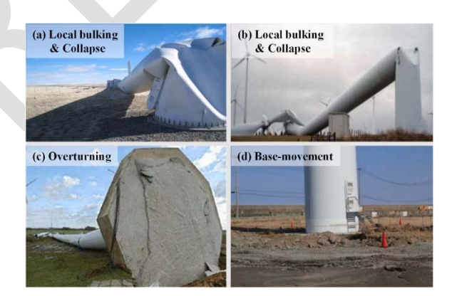
Figure 2 - Possible damaged of WWP due to earthquake (REF)