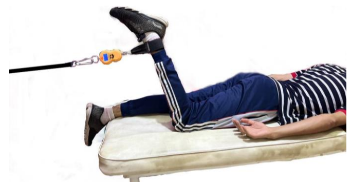
Figure 2. Measurement of the hamstring muscles strength

Person stands erect on base of the device in appropriate place on middle of the base, hands in front of the thighs, and the fingers of the hands are pointing down. The tester grips the tension column tightly so that the palm of one hand is directed forward and the other is directed to the body. When the tester is ready to pull, he bends his knees forward, forming an angle of 90°.