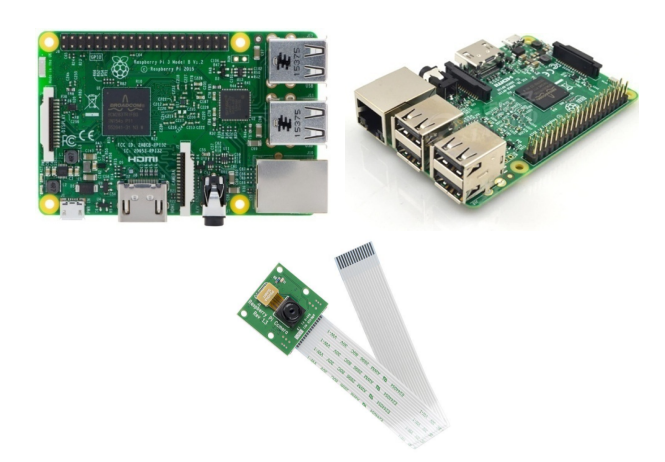
Figure 6. Raspery Pi 3 ands its camera (Raspery Pi 3 ve kamerası)