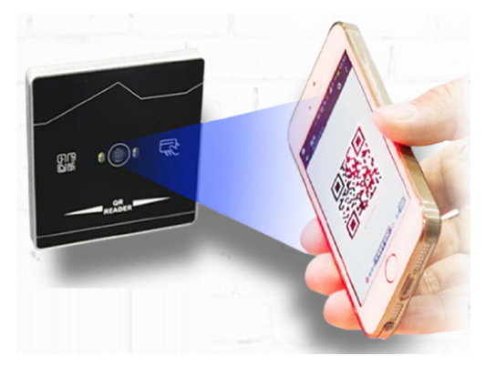
Figure 4. Barcode Access System (Barkodlu Geçiş Sistemi)

However, these systems, like card pass systems and cards with QR or barcode technology, are used voluntarily or unintentionally by other than their real owners, resulting in unauthorized passage, which creates a security vulnerability for the institutions and businesses in question [23].