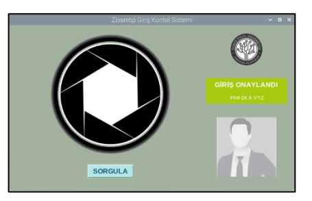
Figure 11. Screenshot of Visitor's Login Confirmation (Ziyaretçi kontrol giriş onay ekran görüntüsü)

On the other hand, when the Raspberry Pi camera reads the QR code, if it is not a registered participant, the message "INPUT NOT CONFIRMED" is displayed on the Red Background as in Fig. 12.