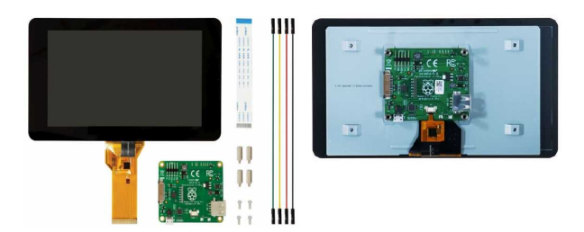
Figure 7. Raspery Pi 7 inch LCD Touch Screen (Raspery Pi 7 inc LCD dokunmatik ekran)