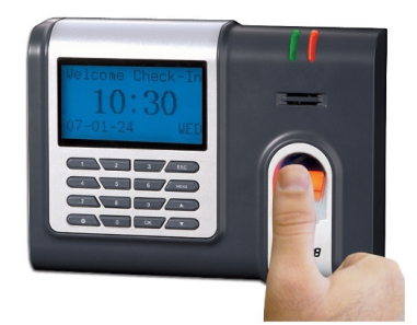
Figure 1. Fingerprint Reader Access System (Parmak İzi Okuyucu Geçiş Sistemi)

As shown in Figure 1, the access systems with fingerprint technology, unauthorized access is prevented by using the password or card sharing method. On the other hand, fake fingerprints of authorized persons can be made using various techniques. In this way, unauthorized people can also pass through.