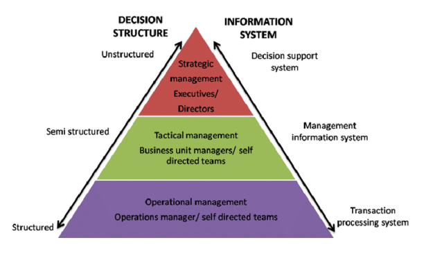
Figure 14. Management Information Systems Pyramid (Yönetim Bilişim Sistemleri Piramidi)

There are access control systems produced by a wide variety of different companies in the market. However, these systems are not easy to maintain, requiring very high-cost annual maintenance contracts by companies. In addition, when a malfunction occurs in these systems in the following years, in cases where the company or the manufacturer cannot be reached, the system remains idle, and users must supply a new system. This situation has become a process that businesses and institutions do not want to encounter. Since the operating system used in Raspberry Pi, Raspberry Pi OS (formerly known as Raspbian), is a Linux-based operating system, Raspberry Pi was preferred when developing the Visitor Control System design and application because it is more stable than Windows and safer against cyber attacks.