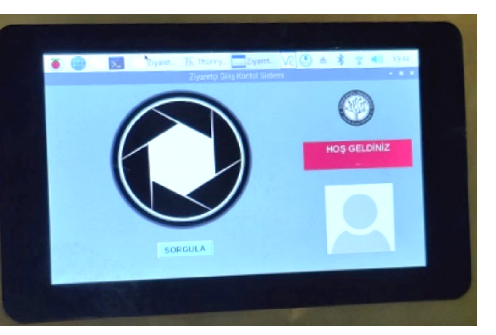
Figure 9. Visitor control system (Ziyaretçi kontrol sistemi)

There is a "QUERY" button on the Visitor Control System shown in Fig. 9. When the button is clicked, the QR Code on the Visitor Entry Card, shown as an example in Fig. 10, is scanned by the camera at the back of the system, and it is determined whether the visitor is authorized to participate by the system.