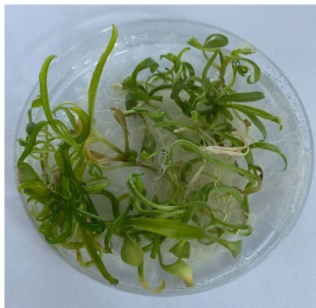
Fig. 2 Growth of C. sativa seeds on MS medium

The negative control, which is the MS medium without kanamycin, was used to examine seedlings one month after sowing in vitro (Fig. 2). There was considerable growth where roots and shoots were intertwined. Plants were healthy, with rooting system ready for acclimatization to the soil.