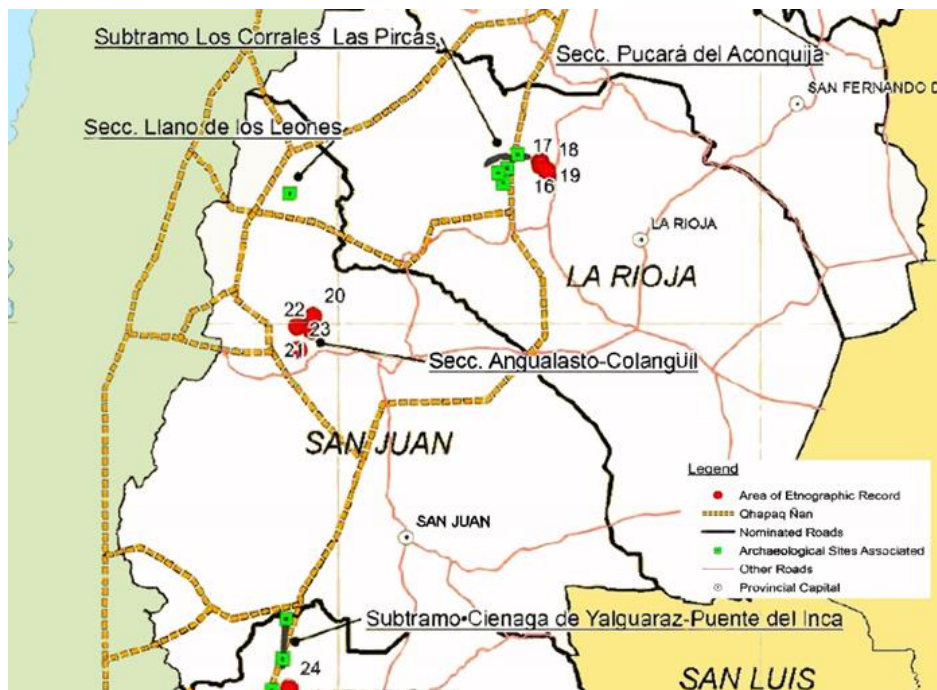
Figure 3. Detail of the map of the final Nomination showing the route of the Qhapaq Ñan in the province of San Juan [35].

With respect to the associated sites, the nomination makes it clear that in the case of Punta del Barro "Inca presence in this mine is up to now an assumption" [35]. For Angualasto, the presence of a mixed Inca ceramic piece in the site museum is mentioned, and it is simply noted that "as for the case of Punta del Barro archaeological site, we suggest there was contact with Incas" [35]. In addition to these sections, the final UNESCO statement shows a map with the location of Inca roads in San Juan. This map shows several entry roads of the Inca Road from the north of San Juan, and several sections that in general do not follow the route of the main longitudinal and transversal ravines (Figure 3).