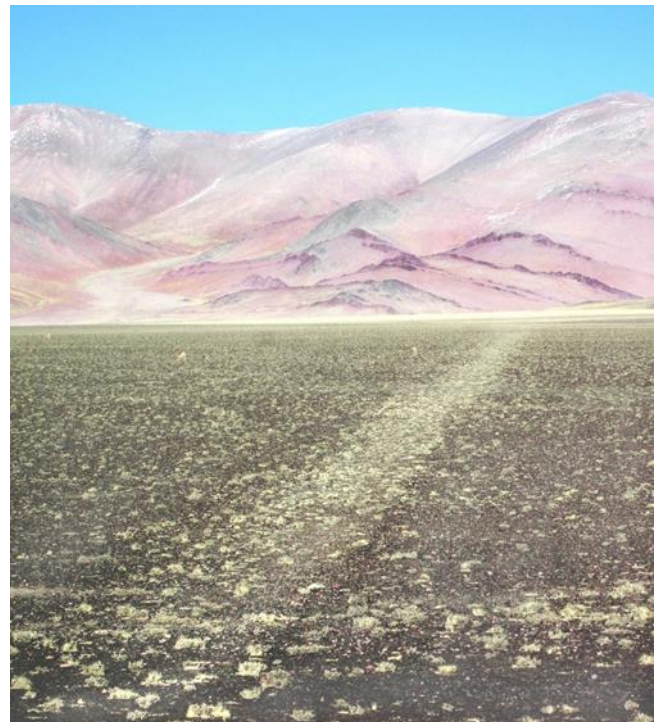
Figure 1. View of the segment Llano de los Leones. Modified from [36].

After withdrawing the Conconta proposal, it was urgent to find a replacement, for which two sections located in the northwest of the province were selected. The northernmost one was called Segmento Llano de los Leones (Figure 1); in the declaration it carries the code AR-LLL-16/CS-2011. It is a straight section, 228 m long and an average width of 2.5 m, which joins Tambo Pircas Blancas with the Morro Negro site. This one does not present architectural structures, but there is an accumulation of Inca pottery, which also appeared associated with the trail [35]. In addition, according to the proposal, this section is located in an area rich in minerals and vicuñas, and Morro Negro could have been part of the Cerro del Toro trail (where a capacocha has been found).