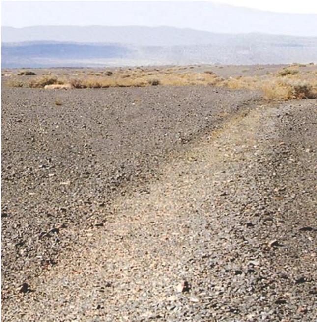
Figure 2. View of the Angualasto-Colangüil stretch.

This section's central area was at a lower ground level than its edges, which would have been produced by the transit of cattle [35]. The arguments for considering this stretch Inca [35] were: