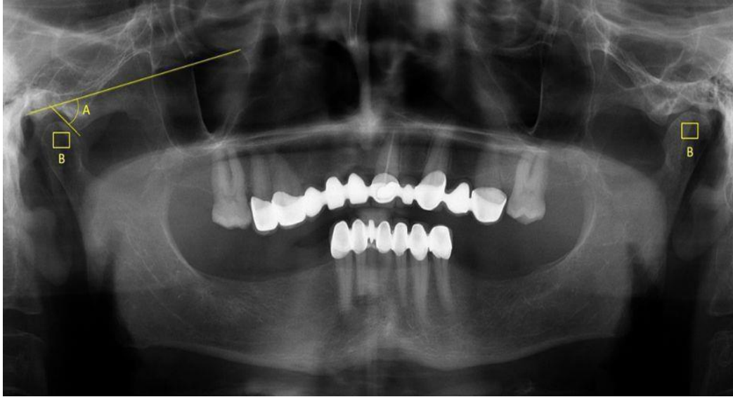
Figure 1: A: Angle of sagittal condylar guidance, B: Selection of the regions of interest of TMJs on both sides.

Gaussian blur was used to distract brightness differences due to overlying soft tissues and varying thicknesses of bone. The resulting image was then subtracted from the original image. Bone marrow spaces and trabeculae were distinguished with the addition of a 128 gray value to each pixel location. After applying binary, erode, dilate, invert, and skeletonizing processes, FD values were calculated. In Figure 2, the stages of fractal analysis are demonstrated.