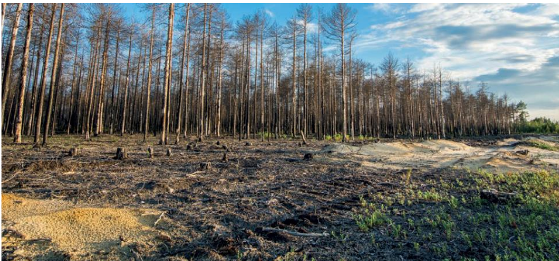
Figure 6. Negative effects caused by acid rain.

"Acid rain lowers the pH value of water and soil and increases the solubility of toxic substances and heavy metals in the environment (Figure 6) (Book B, p.175)",