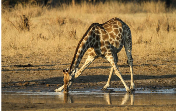
Figure 5. Giraffes spread their front legs sideways when drinking water.

“Giraffes use their legs as well as their necks to bend down sufficiently when feeding or drinking from a source close to the ground.(Figure 5) (Book A, p.187)” ,