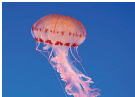
Figure 1. Jellyfish

This dominant category contained 169 sentences (25.19%). This category focused on descriptions of water found in the cells, tissues, and organs or body systems of organisms. In particular, water in the roots, stems and leaves of plants, as well as water carried in plant vascular bundles, was an important component of this category.