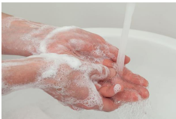
Figure 4. To protect from diseases, hands should be washed with plenty of water and soap.

"To protect against viral diseases, hands should be washed thoroughly with soap and plenty of water before and after eating. (Figure 4) (Book A, p.195)" ,