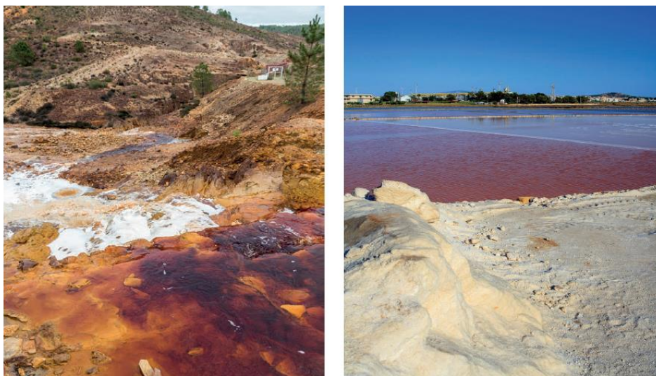
Figure 2. Archaea can survive in extreme environmental conditions.

“Some of the archaea live in hot spring waters and volcano mouths (Figure 2) (Book A, p.156)” ,