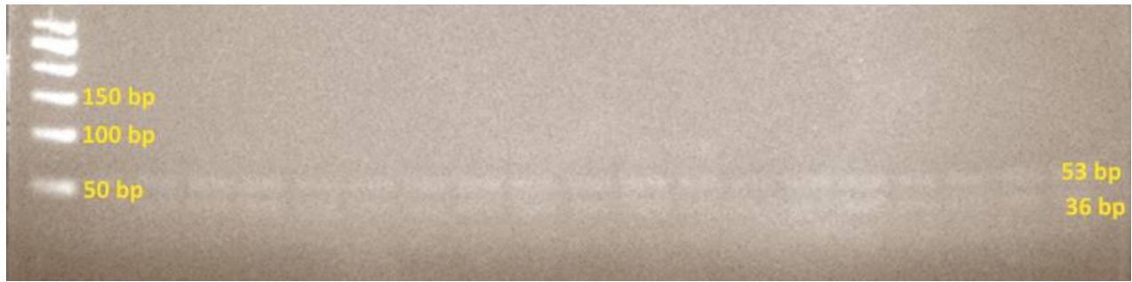
Figure 2. 3% agarose gel image of the band sizes obtained as a result of PCR-RFLP with AvaI restriction enzyme of PCR products for DUMPS disease (DNA Ladder: 100 bp, Thermo, Catalog number: 10416014)

(Figure 2). Due to failure in the discrimination power of agarose gel electrophoresis, the band of 19 bp is not clearly observable by bare eyes in Figure 2.