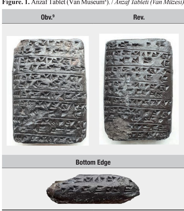
Figure. 1. Anzaf Tablet (Van Museum<sup>8</sup>). / Anzaf Tableti (Van Müzesi)

Due to the absence of any entrance template on the tablet, the lines that should have been the front side were assumed to be the back side in the first transliterations (Belli & Salvini, 2003; CTU IV: CT An-1).6 This mistake affected the overall coherence of the text mentioned in the content and caused the text not to be evaluated correctly. As such inventory records are not sent anywhere, it is not necessary to seal them, and in the Urartian bureaucracy they are usually unsealed.<sup>7</sup> In contrast to such unsealed records in Urartian, it can be argued that tablets sent from higher offices were more elaborately crafted, even taking into account the place where the cylinder seals were to be pressed, and that the space on the tablet was probably carefully utilised by more experienced scribes (CTU IV: CT Ba-1,2; CT Kb-1,2,3,4,7). However, some details of other Urartian bureaucratic records have made it possible to make new assesments about the content of the Anzaf tablet.