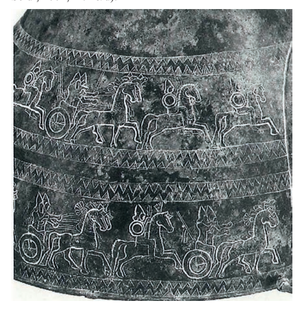
Figure. 5. Chariots Moving with Cavalry / Süvarilerle Birlikte Hareket Eden Savaş Arabaları. (Kendall, 1977, p. 33-35; Seidl, 2004, Pl. 48/d).

and cavalry are also depicted as having bows. All these indicators suggest that these three men (who had not been given any bow) may have been drivers of chariots. Although not directly stated on the tablet, the chariot drivers were probably only given arrows and are mentioned in a single line on the tablet (Lines 7, 20, and 23). The horizontal bands between the lines also show this division. Urartian chariots (GIŠ.GIGIR), which are depicted especially on metal artefacts in Urartian, were probably an elite equipment for the use of high ranking persons. The fact that the authorised persons mentioned in the first three places of the Anzaf list and the three people without any bow are found in the 4th, 11th, and 13th places should not be a coincidence. Can we hypothetically suggest that these soldiers named "Kika.MAH", "Huštú" and "Urdi" were chariot drivers provided to the dignitaries at the top of the list?