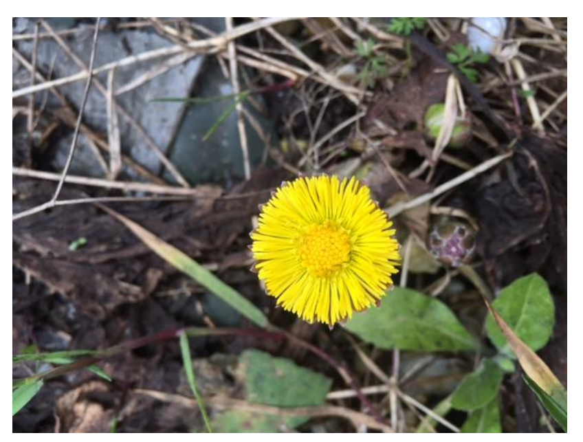
Figure 2. Tussilago farfara'nın genel görüntüsü

pore 10.61 \pm 1.19~\mu m long, 10.25 \pm 1.48 wide; distinct margin and terminal edges acute, the pori situated at midpoint of colpus, are circular and with distinct margin. (Fig. 3, Table 1).