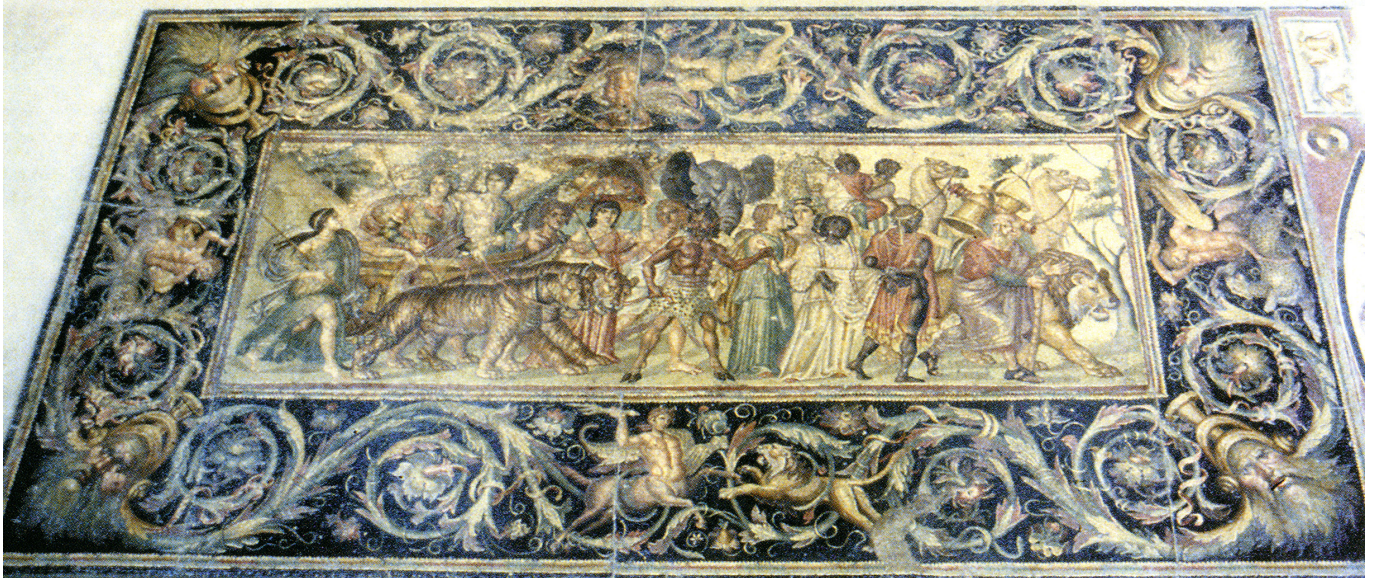
Figure 4 Sétif, Mosaic with Triumph of Dionysos. Djemila, Musée archéologique.