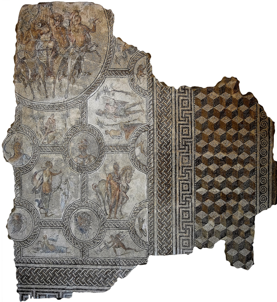
Figure 1 Écija, Mosaic with Triumph of Dionysos. Écija, Museo Histórica Municipal.

or main reception room. At least one other example occurs in a public bath building. Other scholars have analyzed this subject's representation in mosaics 1 , and I shall try to clarify the east-west relationship in the imagery, being very selective about the examples discussed. The theme of the wine god's triumphant return from his conquest of India began appearing in Roman mosaics in the 2 nd century CE, and it experienced a gradual development, influenced in part by Roman imperial art. In early representations, Dionysos stands alone or with a mythical companion in a centaur-driven chariot, which passes over the land or sea. The entire group occupies a single panel, often placed within a larger pavement that includes other mythological and allegorical individuals. This iconography first appeared in the western empire in both North Africa and Spain and then spread eastward to the Greek world. An early example is found in a large mosaic that decorated the Baths of Trajan at Acholla (Picard 1948: 810-815 fig. 1; Yacoub 1995: 30-33 fig. 5a, 5b) in Tunisia. It shows the chariot group of Dionysos, who holds a wine vessel, and a pair of centaurs in a panel surrounded by a procession of sea-creatures; busts of the seasons also punctuated the design. The god is understood as a cosmocratic figure having universal powers of fertility.