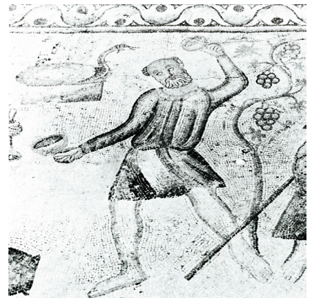
Figure 11 Sarrîn, Mosaic with Dionysiac thiasos , detail of Silenos. In situ .