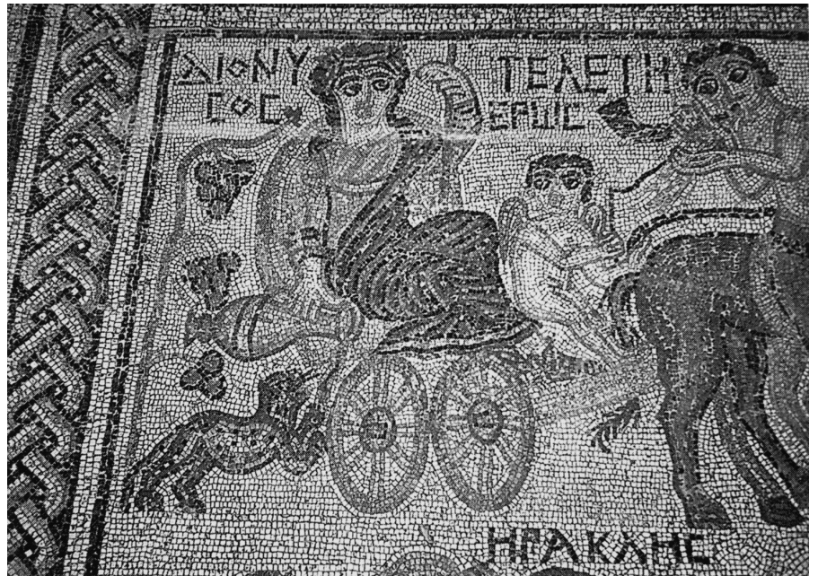
Figure 13 Sheikh-Zuweid, Mosaic with Triumph of Dionysos, detail of Dionysos and Eros.

In the cosmopolitan capital of Constantinople, however, practice of the Dionysiac religion had been vanquished by Christianity in the 5 th century, although Dionysiac imagery remained popular among the educated social elite as part of their classical heritage. That includes representations of the Triumph of Dionysos, as depicted in a fragmentary mosaic from the Psamatia district of Constantinople (Dalgıç 2015), recently published by Ö. Dalgıç and dated to the second half of the 5 th century. The pavement, which ornamented a large reception room in a private house, had a circular format with a central medallion showing the god and a now missing figure (thought to be Ariadne) riding in a chariot drawn by four panthers, all seen in frontal view (Fig. 14, a reconstruction drawing by the author). Around the medallion unfolded a frieze of the thiasos , its members dancing and making music ecstatically; one observes, for example, a maenad sounding long-handled crotala . The most intriguing figure in the procession is a male flutist dressed in contemporary eastern costume of purely secular type that includes a tunic, cloak, and Phrygian cap (Fig. 15). In Dalgıç's view, the presence of this non-mythological figure in a mosaic representing Dionysos's triumph reflects human reenactment of the