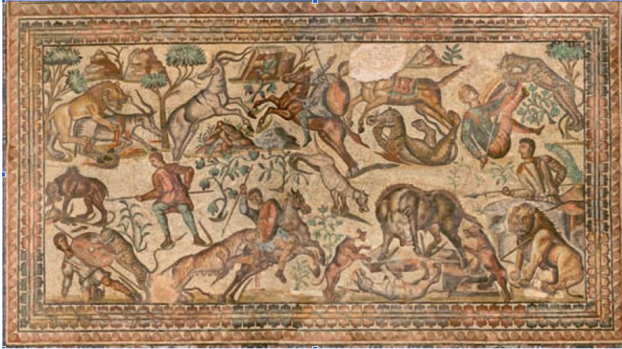
Figure 18 Villa of La Olmeda, Mosaic with hunting scenes. In situ .

representing a hare hunt on a private estate in three stages (Fig. 17). It begins above with the hunters' departure on horseback and on foot in the upper register, followed by cornering of the prey with hounds in the middle zone, and finally the hunters' pursuit of the hare at full speed in the lower register. The triumphant gesture of the cavalier in the lower left corner, throwing open one arm as he looks out, is a common motif in African pavements and is paralleled on Roman sarcophagi.