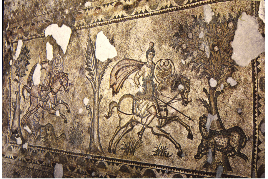
Figure 26 Apamea, Mosaic of Amazons hunting. Brussels, Musées royaux d'art et d'histoire.

et al. 2011: 55-68 photos 60-81, front cover of book) (modern Şanlıurfa), which depicts four Amazon queens in a landscape divided into three registers and punctuated by fruit-bearing trees and rocks (Fig. 27). The women energetically attack a variety of wild felines and an ostrich, moving on foot and on horseback and using an ax, spear, long sword, or bow and arrow as weapons. One hunter in the lower right twists in her saddle as she takes a Parthian shot. The names of three of the Amazons are preserved, including Hippolyte, Melanipe (Fig. 28, detail of Melanipe), and Thermodosa (partly obliterated). All of the figures in the mosaic, human and animal, are loosely arranged in symmetrical fashion around a wounded lioness in the center, from which blood pours. The mosaic's lower register contains additional felines and hounds. (Close examination of the pavement's white ground reveals a scale pattern typical of many late mosaics from the east.) Also popular in hunting mosaics from the orient is Artemis, typically represented as an active huntress, as we see in a mosaic carpet from Sarrín (Balty