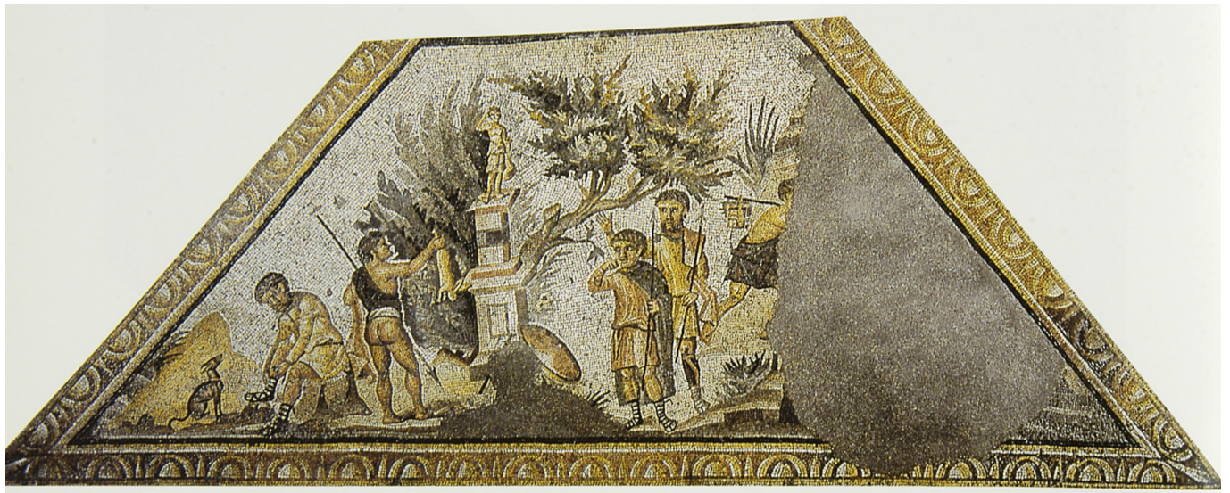
Figure 34 Antioch, Constantinian Villa, Mosaic with hunting scenes, detail of religious sacrifice.

bow and arrow (Fig. 33). The other three hunting episodes are of a realistic type, and one includes a religious sacrifice to Artemis (Fig. 34), comparable to what we saw in the stag hunt from Lillebonne (Fig. 31). Finally, the outermost frieze of the Antioch pavement contains bucolic scenes and corner bust figures symbolizing virtues of the mosaic patron. One of the latter is labeled Euandria or “Manliness” (Baratte 1978: 99 fig. 98), the equivalent of the Latin virtus , and she is shown in the nearest corner of Fig. 32. Thus, in the magnificent mosaic from the Constantinian Villa, the theme of the hunt has several associations, especially with the bounty of the seasons, and it glorifies the patron in an allegorical manner different from the more direct, descriptive imagery of western hunting pavements. In fact, the use of allegorical busts became increasingly common in later mosaics from Antioch, not only those representing the hunt.