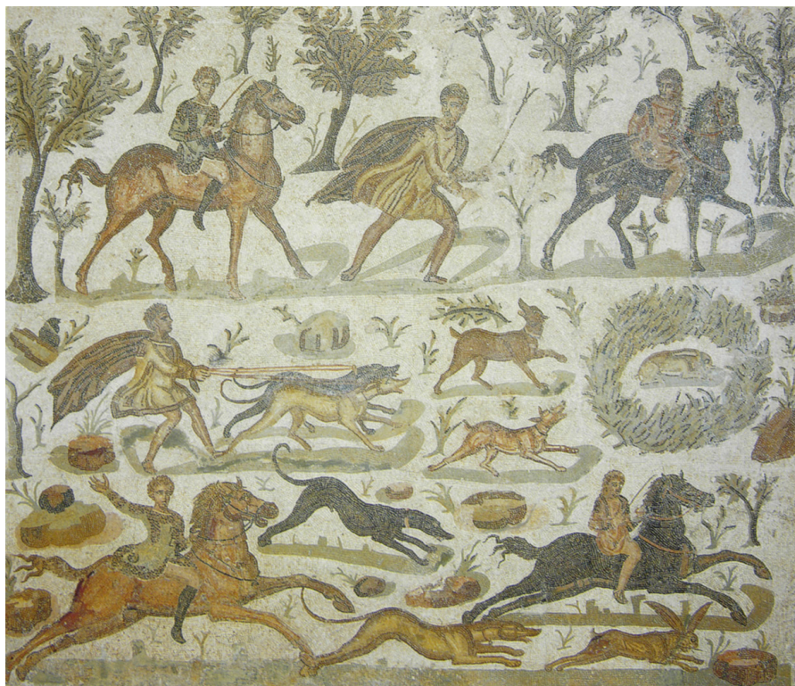
Figure 17 El Jem, Mosaic of hare hunt. Tunis, Musée du Bardo.

Hunting imagery in various contexts, both realistic and mythological, conveys the pleasure and exhilaration of the sport as well as the courage and cunning of the hunter. It also is sometimes associated with staged hunts in the amphitheater or venationes sponsored by the mosaic patron. The particular emphasis varies from one pavement to another. An early hunting mosaic of western origin is a 3 rd -century pavement from El Jem (Yacoub 1995: 251-252 fig. 129) in Tunisia