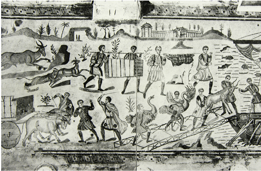
Figure 21 Piazza Armerina, Mosaic of the Great Hunt, detail of one section. In situ .

mosaic, the capture of stags and a wild boar is portrayed. This narrative of the progress of a hunt is picturesque and socially informative.