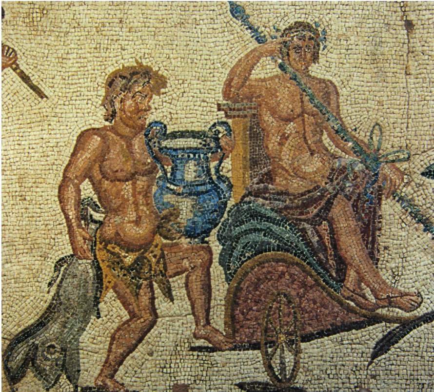
Figure 7 Paphos, House of Dionysos, Mosaic with Triumph of Dionysos, detail of central group.

Monteagudo (Fig. 6). In a symmetrical arrangement, Dionysos, seen in three-quarter view, sits in his chariot pulled by a pair of leopards and guided by Silenos (who wears a woolen garment), as a satyr with a wine crater tries to enter the vehicle (Fig. 7, detail of the central group). The god is framed by standing satyrs and maenads, in addition to Pan and two bound Indian captives, placed at regular intervals on either side of the chariot. The design appears static rather than moving forward. A horizontal frieze with Dionysos in the middle also occurs in a contemporary mosaic from Antioch (Levi 1947: 93-99, fig. 36-38, pl. XV,c; Cimok 1995: 36-37, fig. on these pages), of which only the center and left half are preserved (Fig. 8). In this case, Dionysos's chariot is seen from the front, as members of the thiasos , including Pan, appear on the left. We finally mention a fragmentary mosaic from Sepphoris (Talgam – Weiss 2004: 63-66 fig. 48 col. pl. I,A), of which only the first part of the triumphal procession, inscribed Pompe , remains. Here nimbed Dionysos reclines in a chariot pulled by music-playing centaurs, a pose also adopted by the god on some sarcophagi 3 , and the procession moves leftward.