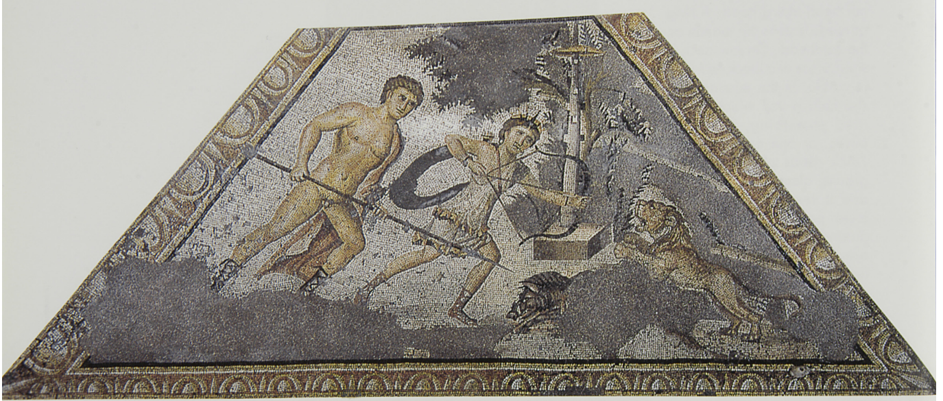
Figure 33 Antioch, Constantinian Villa, Mosaic with hunting scenes, detail of Meleager and Atalante.