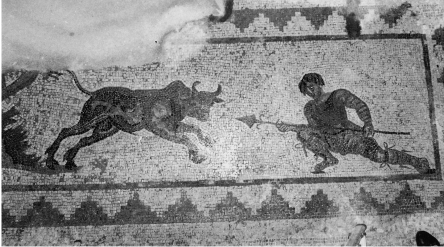
Figure 24 Paphos, House of Dionysos, Mosaic with scene of venationes . In situ .