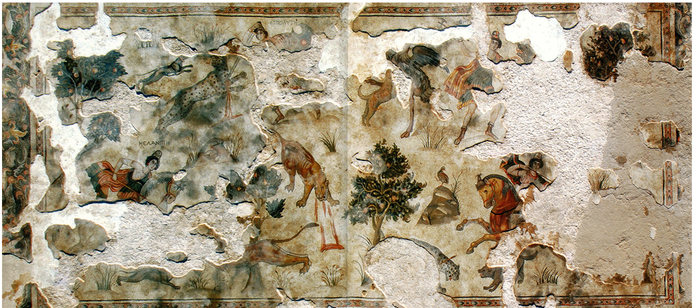
Figure 27 Edessa, Villa of the Amazons, Mosaic of Amazons hunting. Şanlıurfa, Haleplibahçe Mosaic Shelter.

et al. 2011: 55-68 photos 60-81, front cover of book) (modern Şanlıurfa), which depicts four Amazon queens in a landscape divided into three registers and punctuated by fruit-bearing trees and rocks (Fig. 27). The women energetically attack a variety of wild felines and an ostrich, moving on foot and on horseback and using an ax, spear, long sword, or bow and arrow as weapons. One hunter in the lower right twists in her saddle as she takes a Parthian shot. The names of three of the Amazons are preserved, including Hippolyte, Melanipe (Fig. 28, detail of Melanipe), and Thermodosa (partly obliterated). All of the figures in the mosaic, human and animal, are loosely arranged in symmetrical fashion around a wounded lioness in the center, from which blood pours. The mosaic's lower register contains additional felines and hounds. (Close examination of the pavement's white ground reveals a scale pattern typical of many late mosaics from the east.) Also popular in hunting mosaics from the orient is Artemis, typically represented as an active huntress, as we see in a mosaic carpet from Sarrín (Balty