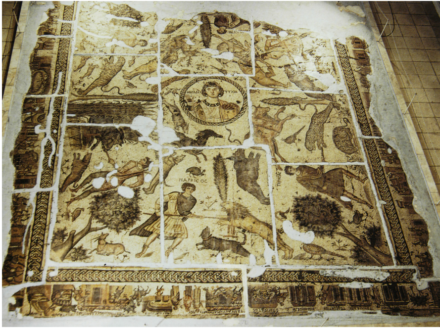
Figure 35 Antioch, Mosaic of Megalopsychia. Antakya, Archaeological Museum.