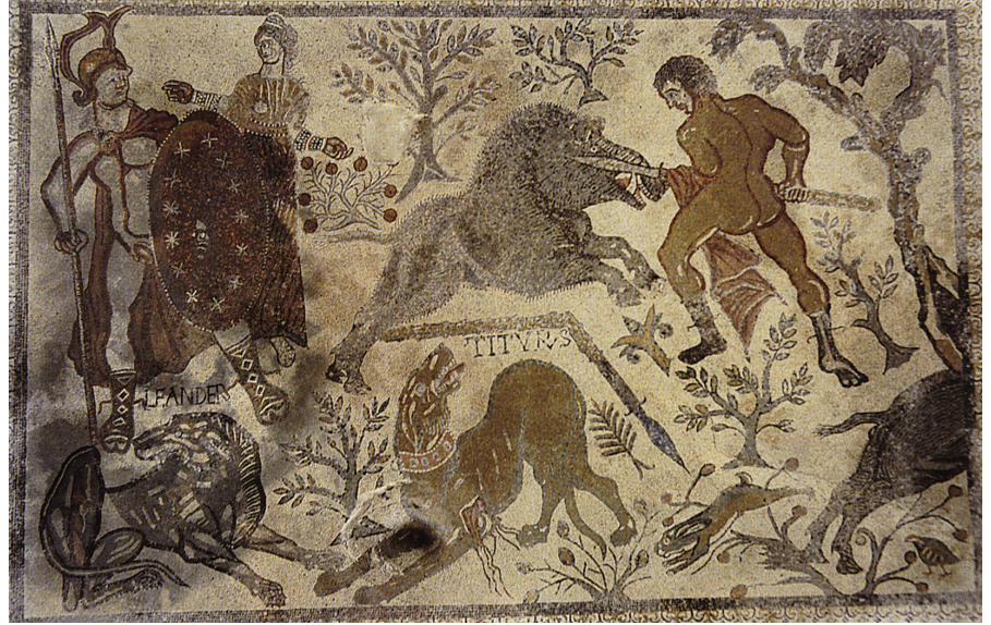
Figure 23 Carranque, Villa of Maternus, Mosaic with hunt of Adonis. In situ .

prey. A Latin inscription, Storia Meleagri , identifies the protagonist; in the upper right corner a partially clad woman, presumably Atalante, looks on, as does a second hunter behind Meleager. In a different 4 th -century mosaic located in the center of the oecus of the Villa of Maternus at Carranque (Fernández-Galiano 2001: 87 fig. on 89), it is the nude Adonis, seen from behind, who appears lunging at a wild boar (Fig. 23). In the upper left appear the deities Venus and Mars, the latter of whom allegedly caused Adonis's death out of jealousy. The inscriptions Titurus and Leander designate the hunting hounds in the mosaic's lower zone. Finally, we mention Diana, who in a pavement of late 2 nd -century date from Utica (Yacoub 1993: 258-259 fig. 189) stands wearing a short tunic and boots as she shoots an arrow at a hind in front of her; it is a gracefully composed scene. Diana also appears alongside Apollo in a 5 th -century hunting pavement from Carthage (Dunbabin 1978: 57-58 pl. 35-37), the Mosaic of the Offering of the Crane, in which a sacrifice is made to the divine pair who patronizes and oversees the realistic hunts occurring around them, divided into registers. The central motif with the twin gods resembles the religious sacrifice to Diana in the Small Hunt at Piazza Armerina (Fig. 20).