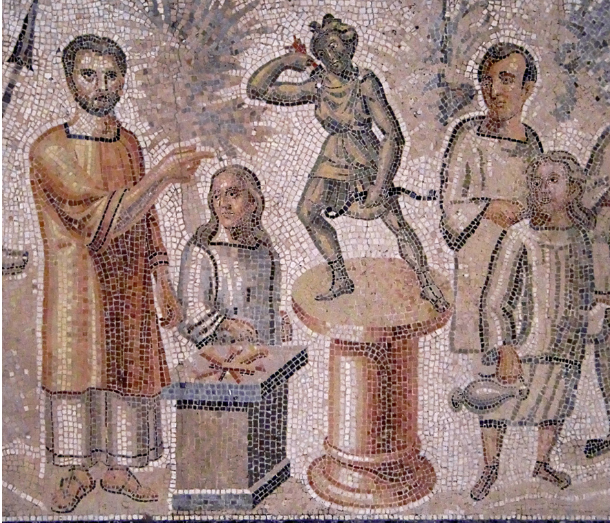
Figure 31 Lillebonne, Mosaic of stag hunt, detail of religious sacrifice.