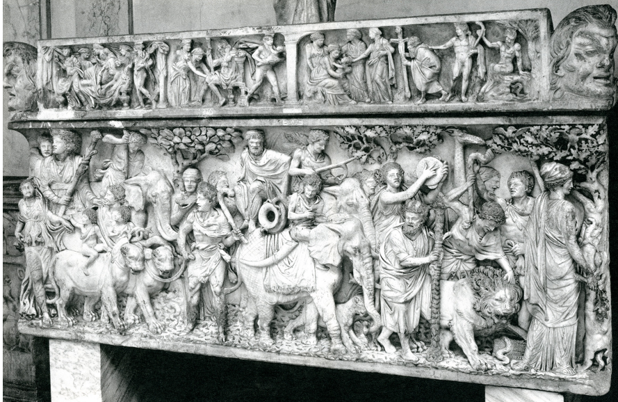
Figure 2 Rome, Sarcophagus with Triumph of Dionysos. Baltimore, Walters Art Museum.