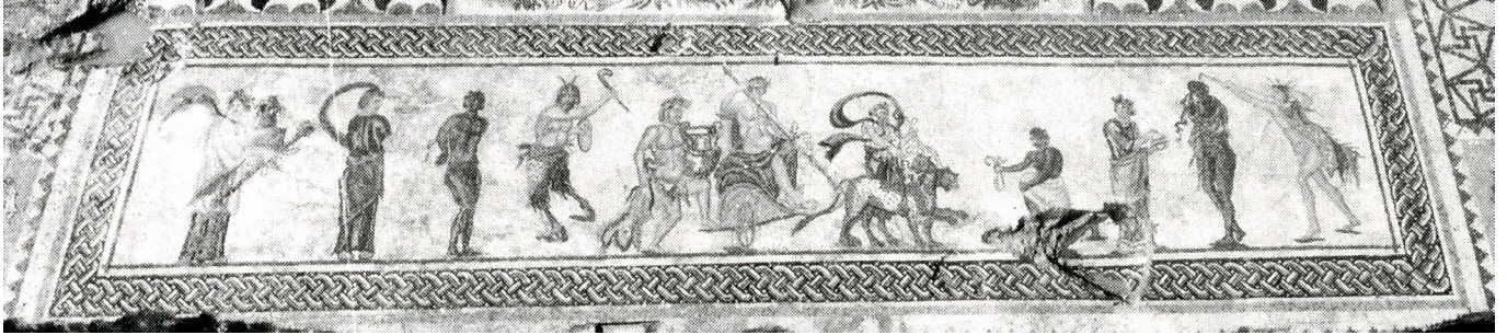
Figure 6 Paphos, House of Dionysos, Mosaic with Triumph of Dionysos. In situ .