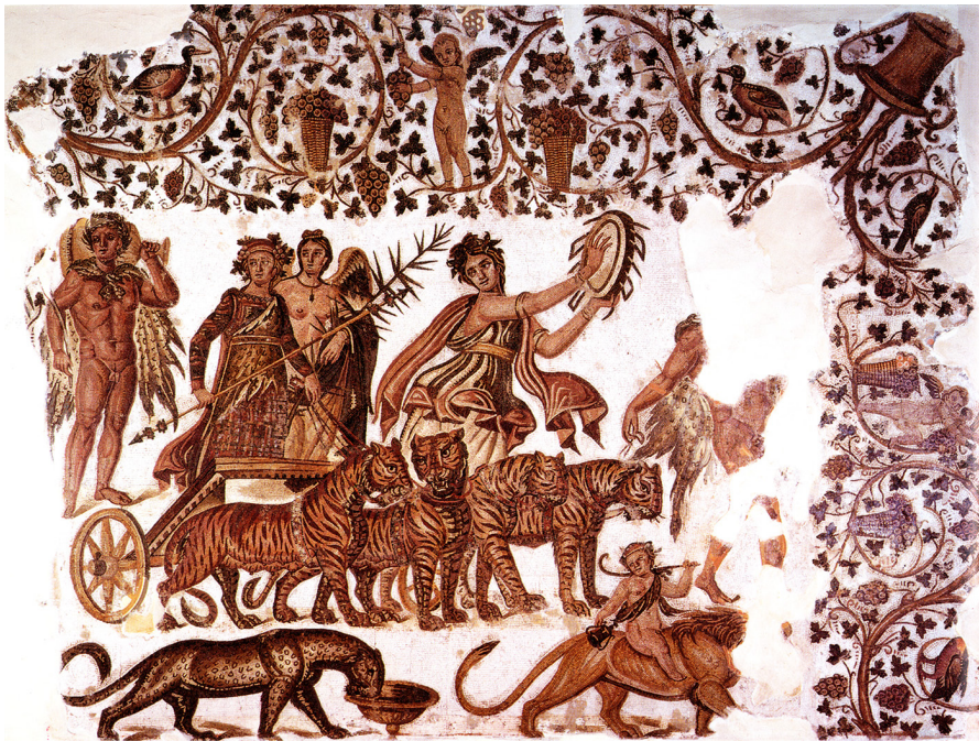
Figure 3 Sousse, Maison du Virgile, Mosaic with Triumph of Dionysos. Tunis, Musée du Bardo.

worldly abundance brought by the god. Another African mosaic of late 3 rd -century date from Sétif (Blanchard-Lemée 2005: 294-299 fig. 4-8) in Algeria echoes the Baltimore sarcophagus more fully (Fig. 4). Dionysos and Victory appear at the left end in a chariot drawn by tigers, in this case led by Pan. Further ahead in the cortège appear not only an elephant, but also two bound captives riding on the back of a camel as other, royal prisoners walk alongside. Silenos, fully draped and with a tall staff, precedes this group. A lush acanthus border with inhabited scrolls, appearing on a dark ground, frames the entire scene 2 .