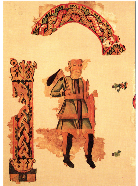
Figure 10 Coptic textile with members of thiasos , detail of Silenos. Riggisberg, Abegg Stiftung.

in various eastern monuments, such as a 4 th -century Coptic textile 5 representing members of the thiasos , including the same type of Silenos (Fig. 10). In this instance, he holds a baton or scourge with a small pouch at the end, apparently an instrument of the mysteries, and he stands framed by an arch. J. Balty identified the same sort of Silenos in a 6 th -century mosaic from an aristocratic house at Sarrîn (Balty 1990: 37-44 pl. IX,3 and col pl. C,2) on the Syrian frontier, in which this individual dances with cymbals in the mysteries, alongside a nurse holding a februum (Fig. 11, one section of the mosaic). A cista mystica appears in the background.