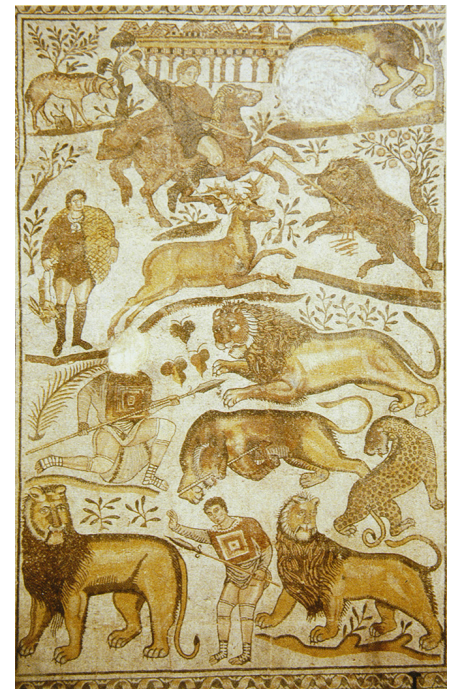
Figure 22 Djemila, Hunting mosaic. Musée archéologique de Djemila.

The realistic, genre type of hunting imagery popular in mosaics of Spain, North Africa, and Sicily, of which we have seen a very limited selection, is supplemented by a smaller proportion of mythological hunts, especially those representing Meleager and the Calydonian Boar, Adonis, and the goddess Diana. Meleager, who died tragically in pursuit of his quarry, was considered by some viewers as the ideal hunter. One example is a 4 th -century pavement from San Pedro dal Arroyo (Regueras Grande 2013: 85 fig. 52) near Avila in Spain. The nude Meleager, wearing boots and a cloak, charges the boar on foot, thrusting his spear forward in a conventional hunting pose, as his hounds converge on the