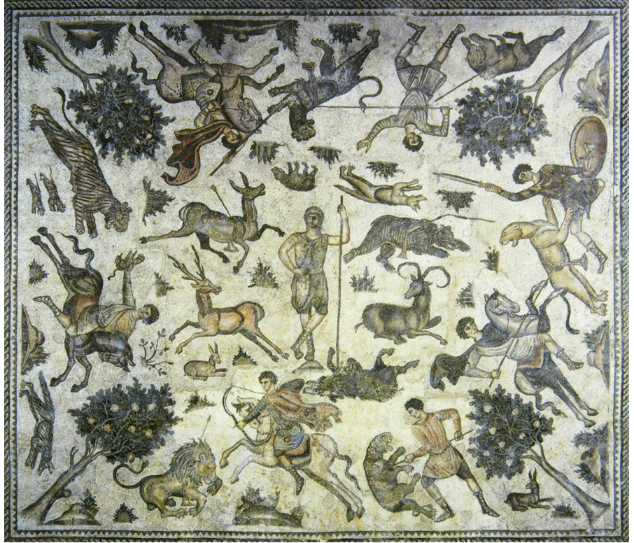
Figure 36 Antioch, Worcester Hunt. Worcester Art Museum.

hunters both on horseback and on foot attacking wild animals with spears and bows and arrows; fruit-laden trees occupy the pavement's corners. In the center a hunter in short tunic and leggings stands triumphantly with his legs crossed and one arm akimbo as he spears a dead boar lying at his feet. Doro Levi (Levi 1947: 344) thought the man might be an ideal, princely hunter with Hellenistic antecedents; he has no counterpart in hunting pavements of the Roman west. A circle of animal victims and other creatures surrounds the figure in the Antioch floor. The hunting episodes on the mosaic's perimeter are finely composed and show originality. In a poignant scene of the left side, a hunter on horseback lures a growling tigress from its den by holding out one of its cubs as he races away. On the right side, a leaping panther mauls a fallen hunter and turns its head toward an advancing horseman threatening the animal with a spear. The latter group recalls both a fallen hunter in the mosaic from La Olmeda (Fig. 18) and the motif of a tigress attacked by two horsemen with spears in the Great Hunt from Apamea (Fig. 25).