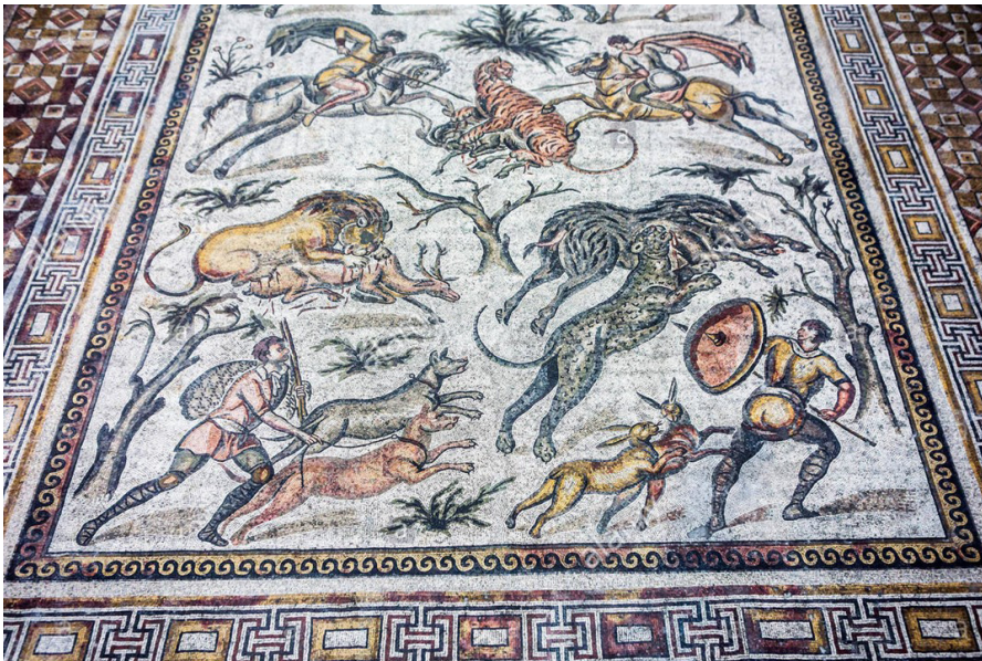
Figure 25 Apamea, Mosaic of the Great Hunt. Brussels, Musées royaux d'art et d'histoire.

At the pavement's mid-point, a beautiful seated tiger with its prey turns its head, growling at two inward-facing horseman with spears who race toward it; it is the design's emotional climax. Higher up are more hunting vignettes that depict archers, felines, and a bear. This mosaic forms an impressive counterpart to the pavements from La Olmeda (Fig. 18) and Djemila (Fig. 22), appearing more formally arranged than they and having a central vertical axis.