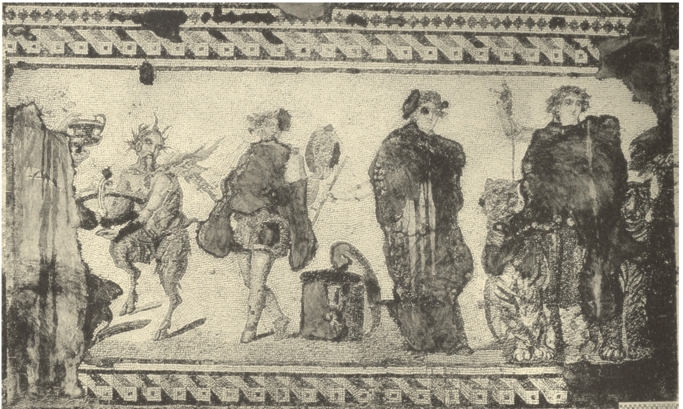
Figure 8 Antioch, Mosaic with Triumph of Dionysos, center and left half. Antakya, Archaeological Museum.

By contrast, some eastern mosaics introduced novel references to the Dionysiac mysteries, seeming to reflect the continued vitality of the pagan cult in the eastern empire. A new type of Silenos appears, for example, in a pavement at Nea Paphos (Daszewski 1985: 24-27 pl. 3-4 fig. 3, lower left corner) published by W. Daszewski (Fig. 9). We see the bearded and balding Silenos in unfamiliar dress as part of the Triumph of Dionysos, riding a donkey next to the wine god's chariot, pulled by a centaur and centauress with musical instruments (one of them holds a lyre), and preceded by a maenad with a ritualistic object. The Silenos, labeled Tropheus , meaning Dionysos's teacher or tutor and foster father, wears close-fitting trousers, shoes, and a short tunic and cloak and has a thoughtful expression like a philosopher. He is an original figure type who has artistic parallels