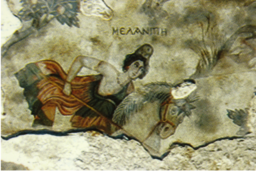
Figure 28 Edessa, Mosaic of Amazons hunting, detail of Melanipe.

1990: 3-5, 24-26 pl. II col. pl. E,2) 10 , ornamenting the same building where a Dionysiac pavement mentioned above (Fig. 11) also occurred.