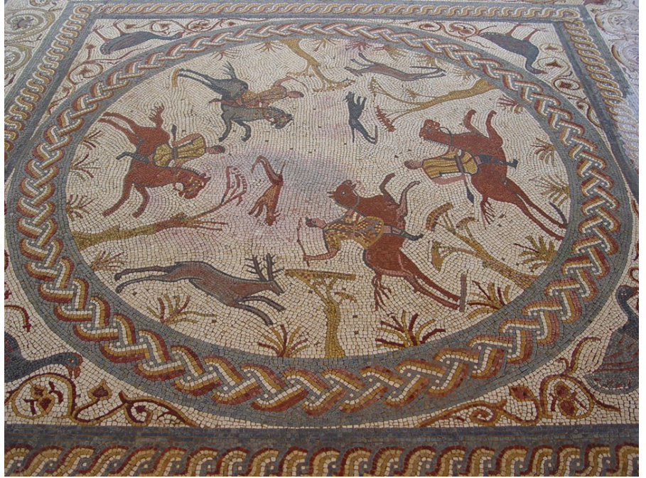
Figure 30 Lillebonne, Mosaic of stag hunt. Rouen, Musée départemental des Antiquités.