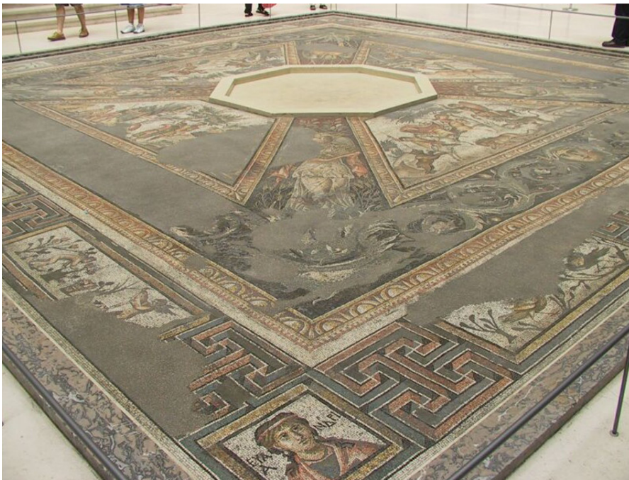
Figure 32 Antioch, Constantinian Villa, Mosaic with hunting scenes and season personifications. Paris, Musée du Louvre.

These compositional and iconographic changes had an impact in the east, as we observe in the pavement from the Constantinian Villa (Baratte 1978: 99-118 no. 45 fig. 94-125) at Antioch, now kept in the Louvre (Fig. 32). A series of individual hunting scenes faces outward from a central octagon where there was a pool or fountain, and they are separated by elegant, standing female personifications of the seasons, each framed by plant sprays and carrying the fruits of her time of the year. Of the four hunting episodes, one depicts the nude Meleager and Atalante in a landscape, and the hero charges the boar, lunging forward with his spear lowered; Atalante, who wears a short tunic and boots, attacks a lion with a