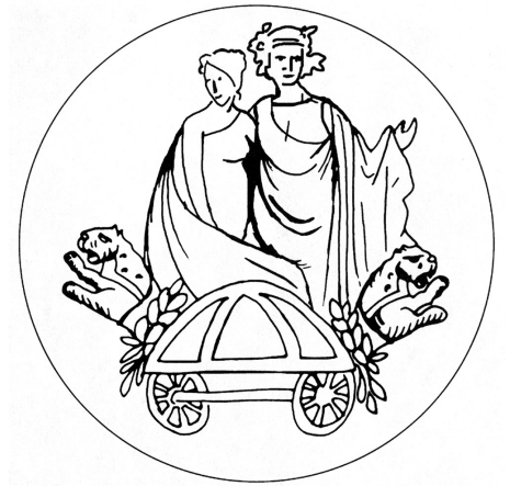
Figure 14 Constantinople, Mosaic with Dionysiac procession, reconstruction drawing of central medallion (Ö. Dalgıç). Istanbul, Archaeological Museum.

In the early 5 th century in the west, there occurs one other striking development in mosaic imagery of the Triumph of Dionysos, namely, a reversal in the direction of artistic influence in representing this theme, now flowing from east to west. It occurs in the Dionysos panel ornamenting the triclinium of the villa at Noheda (Valero Tévar 2013: 325, 328-329 [Panel D] fig. 19) in Spain, excavated by M. A. Valero Tévar (Fig. 16, center and left half of the mosaic). In eastern fashion, there appears a large frieze of nearly symmetrical design, with Dionysos's chariot appearing in the middle in frontal view, and the thiasos extending outward in symmetrical fashion to the left and right. The design recalls earlier mosaics from Paphos (Fig. 6) and Antioch (Fig. 8). At Noheda, the chariot is pulled by two pairs of music-making centaurs. To be sure, the central group has a western antecedent at Écija (Fig. 1), but the design of the frieze as a whole seems eastern-derived. The pavement is a fusion of eastern and western artistic elements, including the identity of the riders in the chariot, respectively,