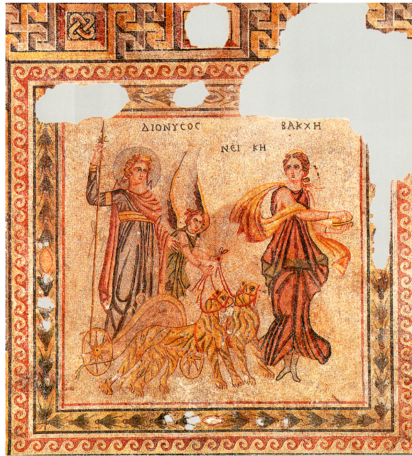
Figure 5 Zeugma, Mosaic with Triumph of Dionysos. Gaziantep, Archaeological Museum.

version of western models is observed in a pavement of the late 2 nd to early 3 rd century from Zeugma (Önal 2002: 18-21 fig. on 19; Abadie-Reynal – Ergeç 2012: 240-241 fig. 271-272 (upper part); 260-261 (Tapis 4, Tableau 1) fig. 297-299 pl. 47) (Fig. 5). It is almost like a quotation of the central part of the pavement from Sousse (Fig. 3), but with figures' names inscribed in Greek. In the Turkish floor, Dionysos, nimbed, richly draped in a long belted tunic and cloak, and holding a thyrsos , stands in a chariot pulled by a pair of tigers, as Nike rides alongside. Here, however, instead of crowning the god, Nike grasps the reins of the wagon, and a maenad labeled Bacche dances in front.