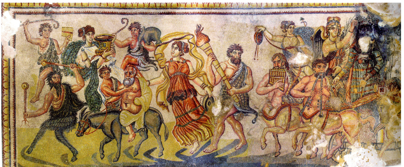
Figure 16 Noheda, Mosaic panel with Triumph of Dionysos, detail of center and left half, In situ .