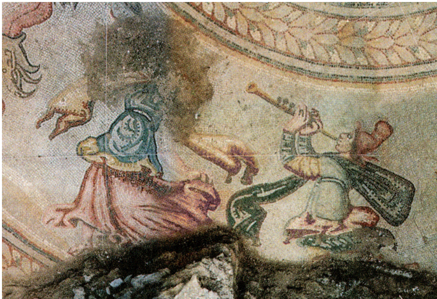
Figure 15 Constantinople, Mosaic with Dionysiac procession, detail of flue player.