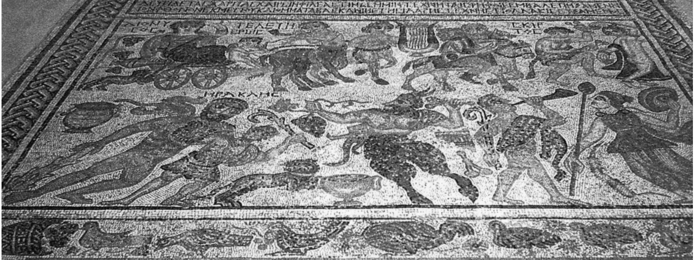
Figure 12 Sheikh-Zuweid, House of Nestor, Mosaic with Triumph of Dionysos. In situ .