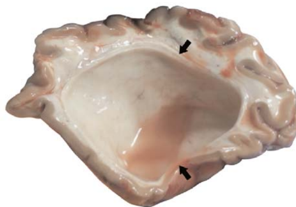
Figure 2. Coronal section through occipital lobe showing disproportionate enlargement of the occipital horn of the lateral ventricle (colpocephaly) (black arrows indicate the cut edge of occipital horn of the lateral ventricle). [Color figure can be viewed in the online issue, which is available at www.anatomy.org.tr ]

In a prevalence study by Kidron et al. [13] determined four distinct callosal defect groups which are complete (absence of all components), partial (presence of a short remnant), hypoplastic (thinning of the all parts of the corpus callosum), and mixed defects (partial corpus callosum agenesis with thinning of the residual part of the corpus callosum). However, regardless of corpus callosum morphology, Brescian et al. [7] classified agenesis of corpus cal-