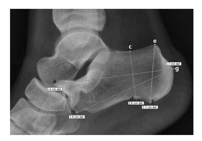
Figure 1. Measurements for maximum width ( a – g ), body width ( b – g ), maximum length ( e – f ), minimum length ( c – d ), and height of facies articularis cuboidea ( a – b ).

Anterior angle (β): The angle in between the line drawn from the lowest point of facies articularis cuboidea to most posterior point of calcaneus's superior surface and the line drawn from the lowest point facies articularis cuboidea to most posterior point of the inferior surface of calcaneus ( Figure 2 ).