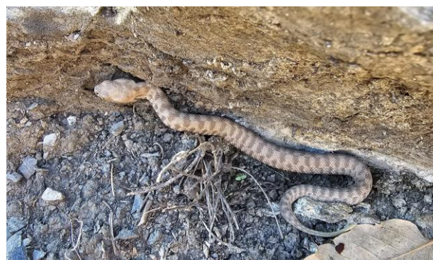
Figure 2. A juvenile specimen M. lebetinus , observed from Direktaşı, Bitlis province (Türkiye) during the winter period (4 December 2023).

The juvenile individual of the Blunt-nosed viper was observed on December 4, 2023 (Figure 2). The sample was detected in the area where pistachio trees were located during pistachio pruning. While the soil surface temperature in the observation area was measured as 17.6°C and the temperature 10 cm below the soil was measured as 20.1°C, the wind in the observation area was calculated as 2m/sec and the humidity was 86.9%.