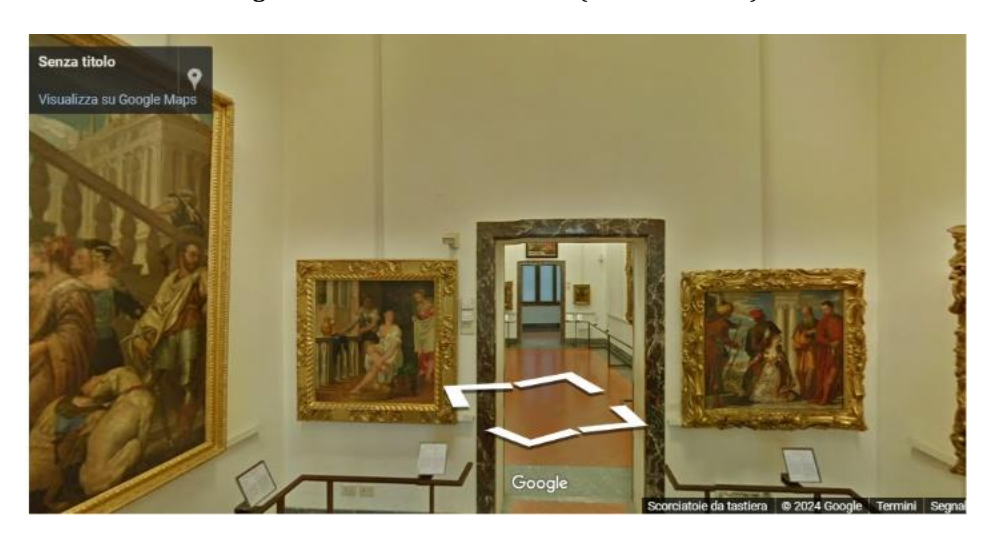
Figure 2. Uffizi Gallery (Uffizi, 2024)

Regarding whether digital games should be evaluated within the scope of a virtual museum, it is necessary to reveal what this concept means first and then examine it through examples. Digital game is a term used for versatile and interactive digital simulations shaped by the eye-hand coordination of the player and supported by animated graphics produced in the digital environment (Gökler, 2017).