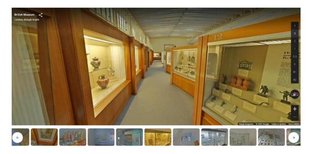
Figure 1. Virtual British Museum (British Museum)

exhibitions, augmented realities, light technology, VR, AR, MR, haptics, and PDAs. There is no museum designed using all these technologies at this moment. Museums that are transferred to the digital environment as virtual museums are designed by transferring the physical museums to a 3D environment, where the visitor can navigate between the galleries with direction arrows or directions and see the exhibits. Major ones among this type of museums around the world include The British Museum (London), Guggenheim (New York), National Gallery of Art (Washington, D.C.), MoMa (New York) National Museum of Modern and Contemporary Art (Seoul), Vatican Museum (Rome), Pinacoteca di Brera (Milan), Pergamon Museum (Berlin), Uffizi Gallery (Florence), Prado Museum (Madrid), Pera Museum (İstanbul), Rijksmuseum (Amsterdam) Egyptian Museum (Turin), J Paul Getty Museum (Los Angeles), Musée d'Orsay (Paris), Guggenheim (Bilbao), South Tyrol Museum of Archeology (Bozen) and the National Museum of Anthropology (Mexico City) (Figure. 1-2).