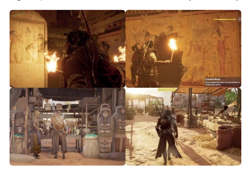
Figure 5. Hieroglyphs, Pictures, and Daily Life Reflecting Egyptian Culture in the Game (From the Game)