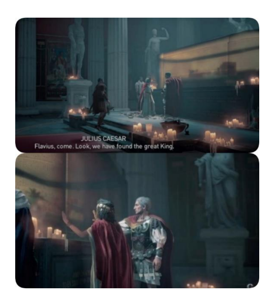
Figure 4. Julius Sezar and the Tomb of Alexander the Great (From the Game)