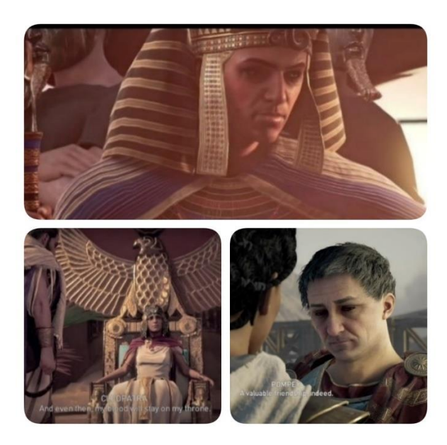
Figure 3. From Historical Characters in the Game Phorah Ptolemy, Cleopatra, Julius Caesar (From the Game)

As a result, digital arts produced in the digital age have more than one sub-genre and digital games can be considered in this context. Drawing on history, mythology, and cultural factors, the games offer pastoriented animation, and characteristic features that go beyond digitalization, as opposed to artifacts displayed directly in museums. Games with a high level of interactivity present not only a building and artifacts but also an entire country, historical buildings, characters, and other details via technological advancements. This is a platform that provides a connection between the past and the future and reflects this in the best way rather than the digitization of a museum. In addition, historical events and phenomena are reenacted. This means that digital games inspired by historical events are within the scope of digital virtual museums of the digital age.