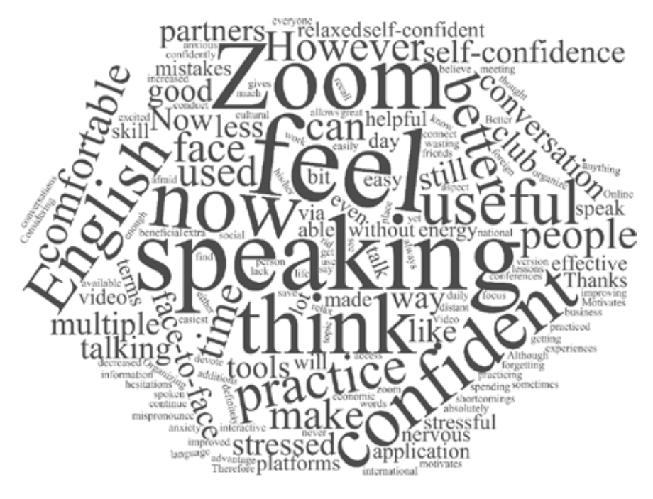
Figure 2. Word Cloud

Same with the previous word cloud generator website, the researchers of this study automatically arranged the words from participants' questionnaire form answers after the study. This word cloud demonstrates the frequency by the size of words from the transcription data of answers, as well. The word cloud is presented down below (Figure 2).