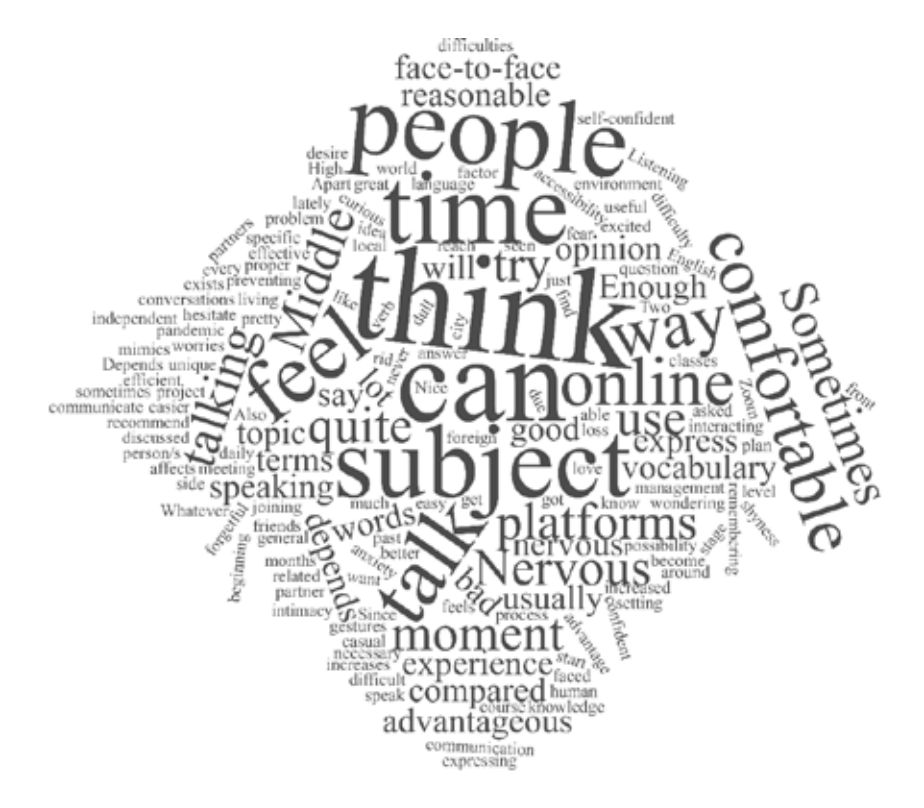
Figure 1. Word Cloud

The researchers of this research used a word cloud generator website (Zygomatic) to arrange words that were shared by participants in questionnaire form before the study. It displays the frequency by the size of words from the transcription data of answers. The word cloud is presented down below (Figure 1).