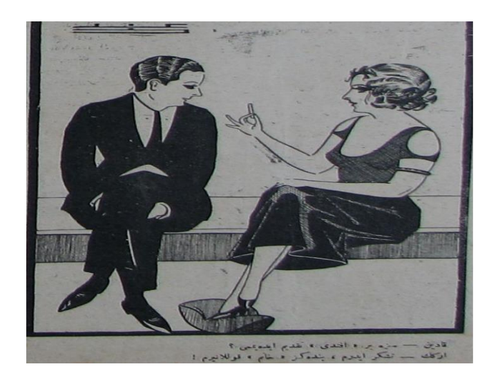
Woman- May I introduce a "master" to you?

Akbaba was a magazine that drew attention not only with its articles but also its cartoons, and issues related to men and modern women were frequently featured. In the early Republican period, the modernization of women had become identified with how they dressed, but the magazine stated that this was also related to women's discourse. The cartoon titled "New Cigarette Names" is an example of this.<sup>68</sup>