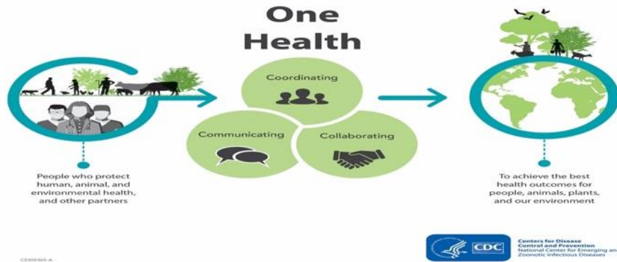
Figure 3. Dimensions of the One Health Concept

( https://www.cdc.gov/onehealth/images/multimedia/one-health-def.jpg )