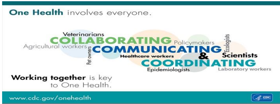
Figure 2. One Health involves everyone.

The concept of One Health is an approach that can only be achieved through a consensus that considers the health of humans, animals, and wildlife together with a more general perspective on health and disease. Therefore, such a health perspective is crucial for establishing the main connection between the health and diseases of humans, animals, and wildlife, and the threats posed to food origins, finance, and biological diversity. It is of great importance in preserving healthy environmental settings and stable ecosystems, which we all need. 1