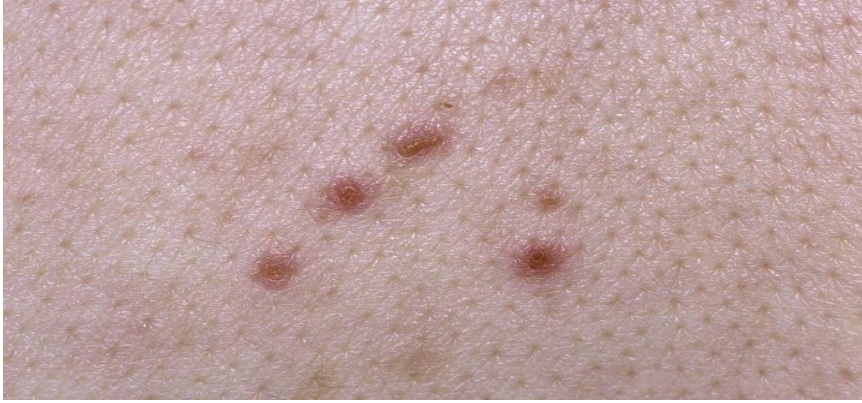
Figure 5: Image showing the wounds caused by scabies on the skin

In a person who is experiencing scabies for the first time, symptoms typically begin to appear within two to six weeks. However, in individuals who have had the disease before, symptoms may start to appear earlier. 22