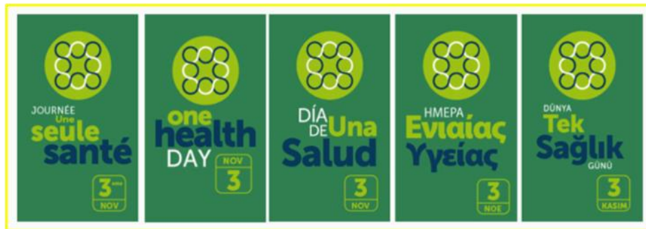
Figure 1. Health Day Logo

The origin of the concept of one health dates back to Hippocrates' notes, which explain the mutual dependency between public health and a clean environment. Italian doctor Giovanni Maria Lancisi wrote about the significance of environmental factors in the spread of diseases and highlighted the importance of reducing animal populations and quarantine methods in controlling malaria. The term 'zoonosis' was first used by Prof. Dr. Rudolf L.K. Virchow in 1855. During his research on 'Trichinella,' he encountered a pathogen significantly different from those he had previously seen. He coined the term zoonosis to establish a connection between human and animal infections, emphasizing the lack of distinction between human and veterinary medicine. He asserted that findings in one field should aid the development of the other. 4 Prof. Dr. Calvin W. Schwabe, known as the father of epidemiology, suggested that the collaboration of two different disciplines, human and veterinary medicine, is essential in combating zoonoses, one of the significant challenges of the 21st century. He advocated for a unified approach termed 'One Medicine, One Health'. 5 The concept of one health has evolved from being called 'One Medicine' until the 2000s, to 'One World – One Health' between 2000 and 2008, and has been known as 'One Health' in the international literature since 2008. 6