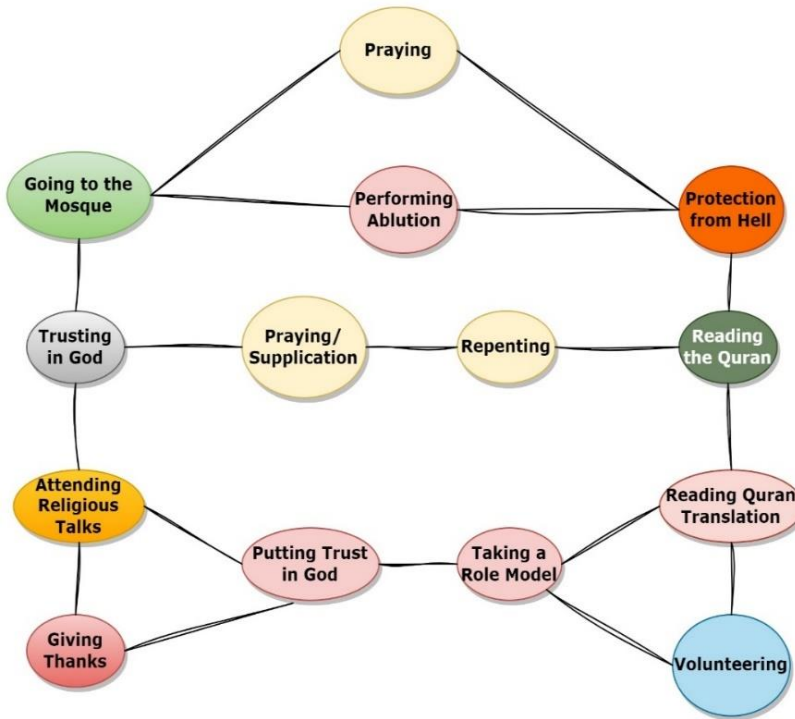
Figure 2: Religious Coping Strategies Used by Turkish Youth