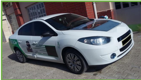
Figure 2. Image of the electric vehicle under application.