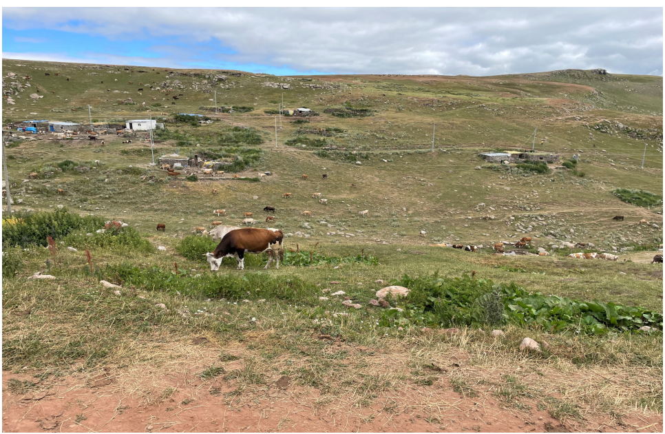
Figure 2. A View from Koyunpınar Upland (Hanak/Ardahan)