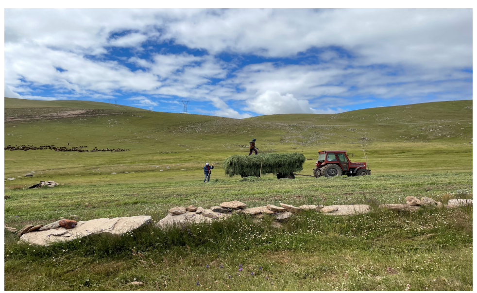
Figure 4. A Transhumants in the Research Area