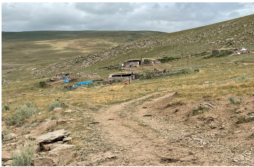
Figure 6. A View of the Upland Houses in the Research Area