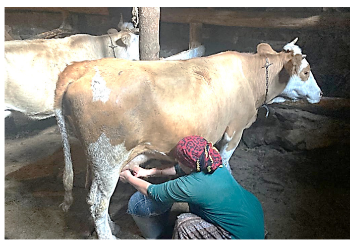
Figure 5. A Transhumant Woman in the Research Area

Agriculture is not practiced because the duration of stay on the uplands is short, the climate is harsh and the soil is unsuitable. The use of shepherds on the uplands is a valid method. Because it is essential to have a shepherd to graze, milk and protect animals in rangelands. Because the houses on the uplands are used temporarily, they are quite old buildings in the style of huts, made of earth and stone (Figure 6). There are no shopping, health and security services on the uplands. Mobile phone and internet network are limited for communication. In this case, the transhumants lead a semi-primitive lifestyle.