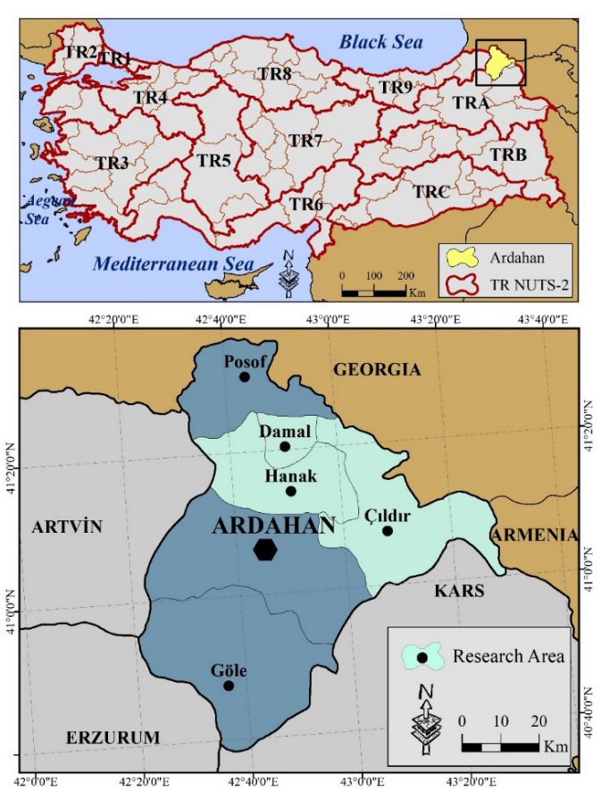
Figure 1. Geographical Location and Research Areas (Hanak, Damal and Çıldır) of Ardahan Provence in Türkiye