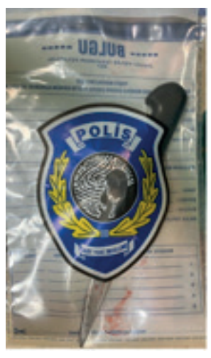
Figure 4. Bread knife removed by thoracotomy