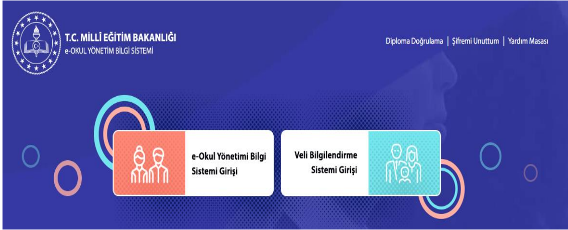
Figure 2. E-school user interface (URL-1, 2023)

With the e-school application, student transactions, school transactions, provincial and district directorates transactions, and Ministry-level transactions can be carried out as desired. Both administrators and families as the immediate stakeholders can use the E-school application as well. With that being said, one of the most essential features of this system is that it brings about transparency for the education services processes and gives rise to interactivity. At the same time, a considerable number of distance education platforms can be integrated into this very system, during times of crises like the Covid-19 pandemic. Integrating other education services units, such as Education Informatics Network (EIN) and the Teacher Informatics Network (TIN), into this system enables the acquisition of a high volume of data as a learning analytics tool. E-school application is actively used at present and appears as the most frequently used information source as a learning analytics tool.