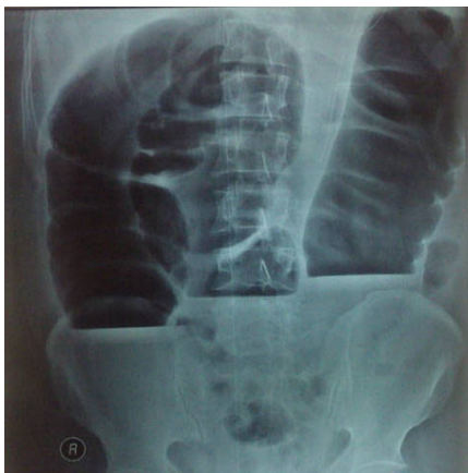
Figure 1: Plain radiograph of the abdomen demonstrate the classic inverted 'U' sign of a sigmoid volvulus.

TDH should be suspected in patients with an acute colonic obstruction, particularly if the patient has a history of trauma. Early diagnosis of TDH is very important for appropriate surgical management.