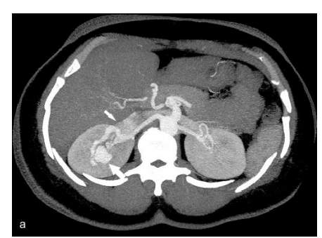
Figure 3. Contrast-enhanced MDCT image demonstrates RAVM (thick arrow). Also early opacification of the right renal vein (thin arrow) and inferior vena cava is seen. Axial thick-slab maximum-intensity projection (a) and volumerendered reconstructed display seen from oblique posterior perspective (b).

performed with a 16 channel MDCT scanner (Lightspeed 16, GE Medical Systems, Milwaukee, WI, USA). The scan parameters were 16x 1.25-mm detector configuration, 1,25 mm section thickness, 1,25 mm reconstruction interval, gantry rotation time 0.5 s, pitch 0.938, 400 mAs, 120 Kv. The region of interest for scanning was adjusted from suprarenal abdominal aorta to the iliac artery bifurcation. After insertion of 18 -gauge catheter in to an antecubital vein, 120 mL of ioversol 300mg I/mL (Optiray, Mallinckordt, St. Louis, MO, USA) was injected with an automatic injector at a rate of 4 mL/s. All CT data were transferred to a Workstation (Advantage Windows 4.2, GE Medical Systems) ) for three-dimensional (3D) reconstructions (multiplanar reformat, maximum intensity projection and volume rendering). MDCT angiography was revealed early opacification of the right renal vein and inferior vena cava. Also enlargement of the interlobar renal artery branch was noted. In the upper pole of the right kidney, a cirsoid type RAVM approximately 3 cm in diameter was demonstrated (Figure 3a, b) MDCT