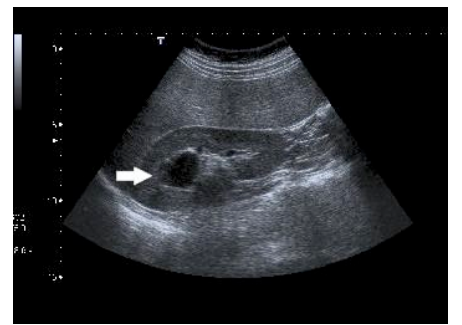
Figure 1. US image of the right kidney shows anecoic cystic mass in the upper pole (arrow).