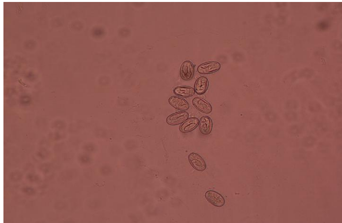
Figure 3. Eggs of Dispharynx nasuta