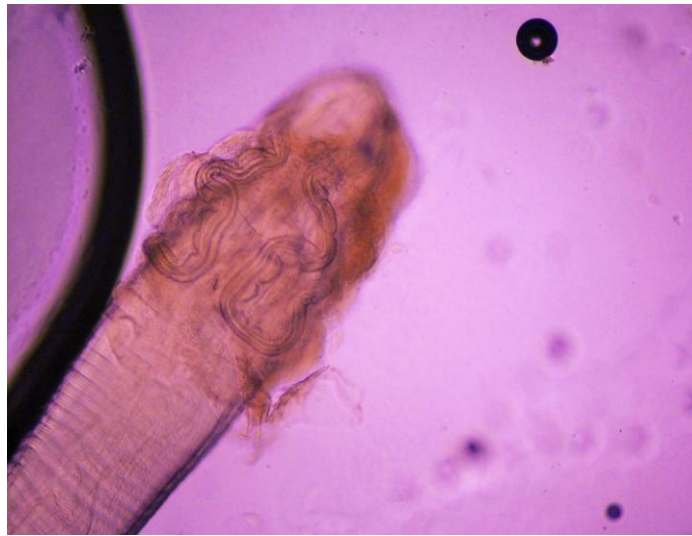
Figure 2. Anterior end of Dispharynx nasuta (Female)