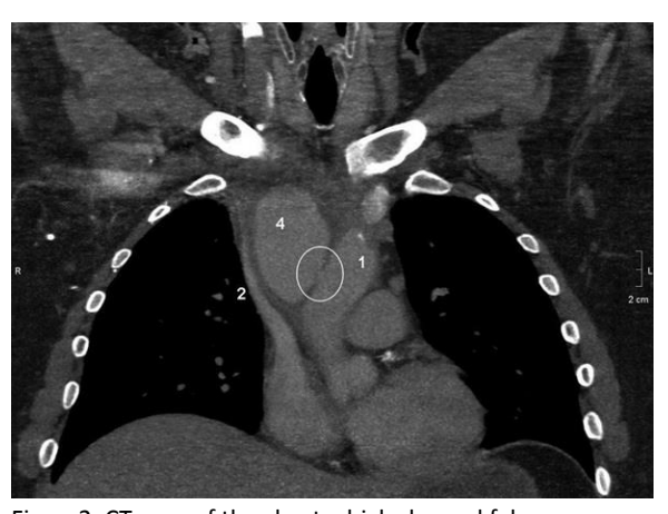
Figure 2. CT scan of the chest which showed false aneurysm in the ascending aorta in the region adjacent to the necrotic mediastinal lymph node.