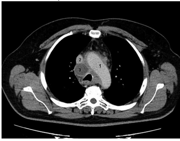
Figure 1. CT shows upper mediastinal lymphadenopathy.

The patient had full recovery post-operatively and received six weeks of intravenous vancomycin. He then completed rest of the 6 cycles of R-CHOP. He was in PET negative remission 6 months later and remained in good health till the report.