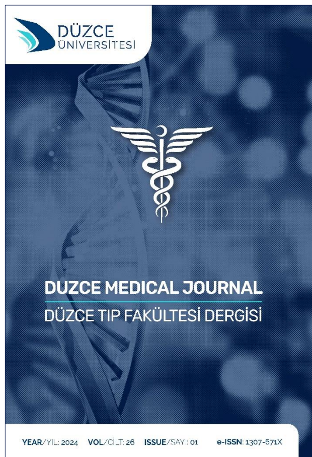
Figure 2. The new cover of the journal since 26 th volume