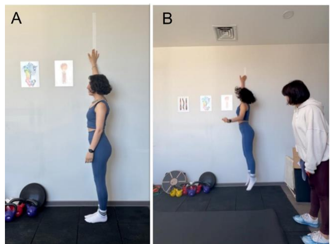
Figure 2. Vertical jump test, initial position (A), vertical jump (B)

Vertical Jump Test was used to evaluate the jumping performance of the participants. The vertical jump test, also known as the Sargent Jump, is a test designed to measure lower body strength and power (Sargent, 1921). The test involves measuring the height an individual can jump using a vertical jump test gauge or a marked wall (Fig. 2). The procedure for the vertical jump test is as follows: The person stands sideways against a wall and extends the hand closest to the wall. With the feet flat on the ground, the point of the toes is marked or recorded. This is called standing reaching. The person puts chalk on their fingertips to mark the wall with the height of their jump. The person then moves away from the wall and jumps vertically as high as possible, using both their arms and legs to help propel their body upwards. Try to touch the wall at the highest point of the jump. The distance difference between the standing height and the jumping height is points. The best of three attempts is recorded, and the results can be compared to normative data for various age groups and genders (Maulder & Cronin, 2005).