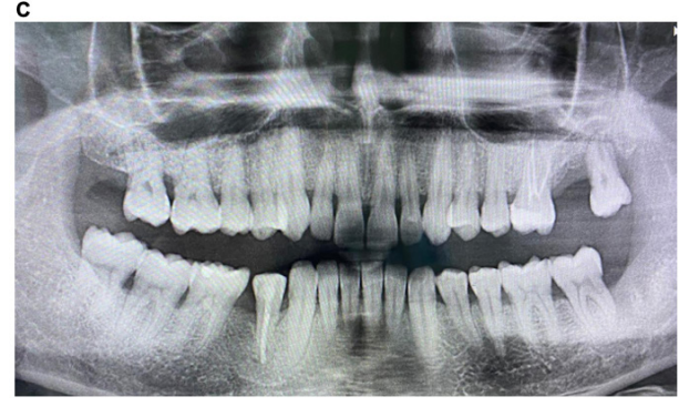
Figure 4. (A) periapical radiograph taken from the patient 3-month follow-up, (B) 6-month follow-up, (C) panoramic radiograph taken from the patient 5-year follow-up.

Studies (10.35) examining the impact of root development level on success rates have yielded varying results. Kristerson's study (26) of 100 premolars indicated that transplantation of teeth with a root development level between ½ and ¾ yielded the best prognosis. Similarly, Kristerson and Lagerström (36) reported success rates of 87% for teeth with incomplete root development and 67% for mature teeth. Lundberg and Isaksson (23) following 278 teeth for an average of 6-year, found success rates of 94% for teeth with open apices and 84% for those with completed root formation.