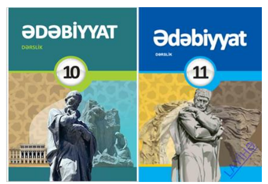
Figure 1. Azerbaijan literature textbook outer cover

The 10th grade Literature textbook was published in 2022 by Baku Publishers. It is 208 pages. The authors of the book are Sultan Husseinoglu Aliyev, Bilal Agabalaoglu Hasanov, Aynur Jafar Mustafayeva. 11th grade Literature textbook was published by Baku Publishers in 2018. It is 208 pages. The authors of the book are Isa Habibbaylı, Soltan Aliyev, Bilal Hasanov, Aynur Mustafayeva.