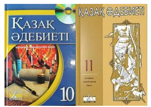
Figure 2. Kazakh literature textbook outer cover

The content organisation of both books includes the imprint page, preface, chapters, literary theory, literature used, table of contents, inner cover. 10th grade Kazakh Literature textbook consists of four chapters: "Poetry is the King of Words", "Artistic Thought in Prose", "The Artistic Word, Weaved with Myth", "Time, the People of the Age". 11th grade Kazakh Literature textbook also consists of four chapters: "Key to History", "Decision and Reason", "Centenary Work", "Criticism in Literature".