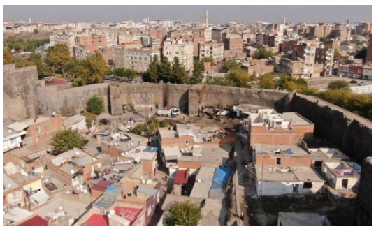
Figure 2. Distorted Urbanization in Sur District

The deep-rooted history of Diyarbakır Sur District dates back 12,000 years. Recent archaeological excavations in the Bismil district of the city have revealed that settlement began in "Körtik Tepe" between 10,400-9250 BC. Çayönü Hill near Ergani, which provides the best example of Anatolia's oldest agricultural village communities, sheds light not only on the history of our region but also on the history of world civilization with its history dating back 10,000 years.