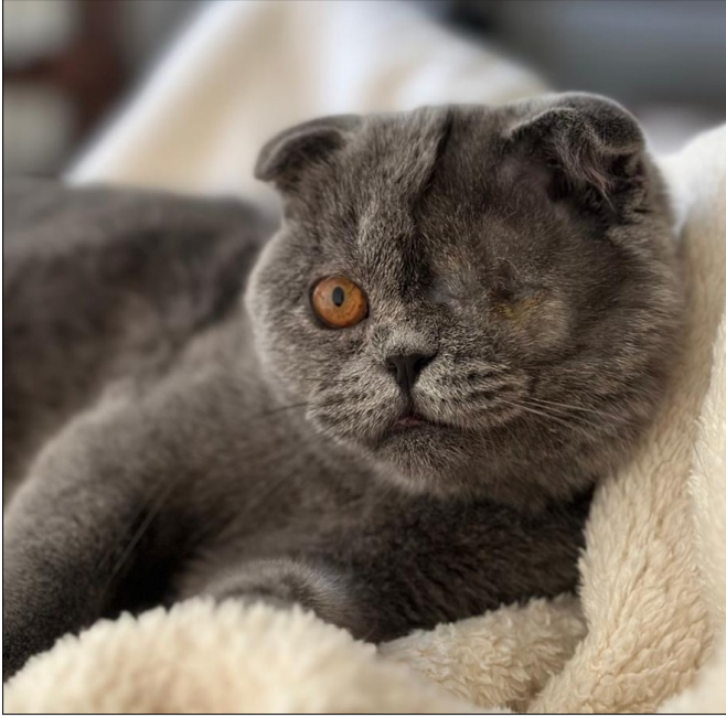
Figure 4. Patient's right eye in postoperative 1 st , 3 rd and 6 th month follow-ups.

line was stitched using a simple separate stitch technique with 4/0 PGA. When the stitches were removed at 10th post-operative day, ocular examination findings were normal. Antibiotic eye drop use was ceased but the artificial tear drops use were continued. No recurrence was observed in the patient's right eye in postoperative 1 st , 3 rd and 6 th month follow-ups (Figure 4).