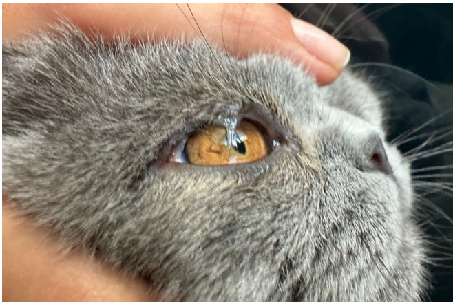
Figure 1. Lateral part of the upper palpebrae and its edges absent and trichiasis

A six-month-old female Scottish fold cat with blepharospasm, keratitis, epiphora and photophobia was referred to the Surgery Department of the Faculty of Veterinary Medicine, University of Istanbul-Cerrahpaşa. In the ophthalmic examination, it was observed that a part of the right upper palpebrae and its edges were unilaterally absent, and the skin hairs were in contact with the corneas, causing keratitis and blepharospasm (Figure 1). The palpebral fissures were not completely closed during blinking and causing epiphora. There is also congenital micropthalmia and mucopurulent discharge was observed in the left eye. Using of appropriate surgical procedures was planned to correct to all these ocular malformations and situations.