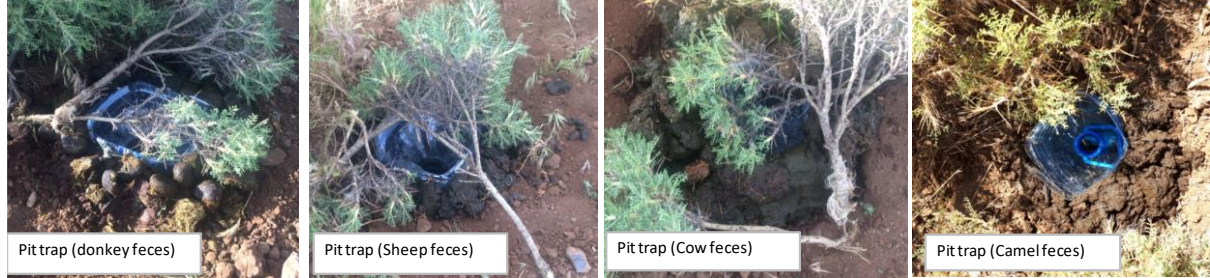
Figure 2. Pit Traps.

Adult dung beetles have been collected by hand, pit traps, water traps and light traps. The types of traps used differed according to the regions. The most common trap which used in the region has been pit traps. Traps placed so at least one pit trap was set up in each area. In addition to the traps, samples also collected from locations (without traps) where animals are densely populated and manure is released. In these localities, sheeps and cattles are grazed all day in packs. Therefore, the organic fertilizer material, such as cattle, donkey, sheep, camel and chicken droppings that found naturally in the study area used as attractants (Figure 2).