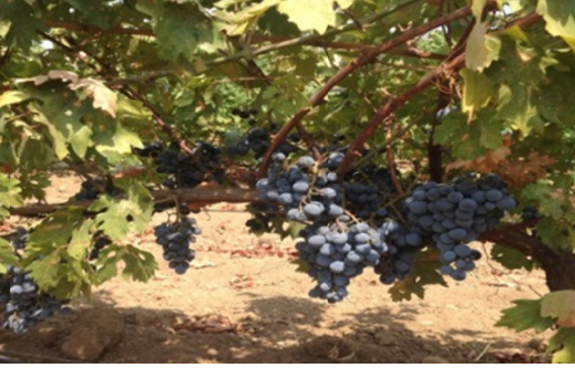
Figure 1. View of vineyard area and Boğazkere grape variety

The grape berry and came cutting tests were carried out during the different phenological stages of the veraison (30 August), 15 days after veraison (15 September) and harvesting time (30 September) in 2016. Grape canes (Figure 2), which have between five internode, has different diameters. The test samples were randomly harvested by hand from vineyard. Harvested and collected canes which have different internode and grape clusters (Figure 3) were transported to laboratory of Department of Agricultural Machinery and Technologies Engineering,