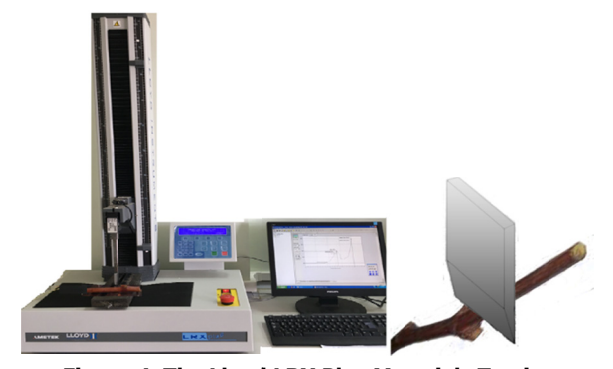
Figure 4. The Lloyd LRX Plus Materials Testing Machine and cutting blade

Lloyd LRX Plus Materials Testing Machine were used for cutting tests(Figure 4). During the tests, the cane samples were placed on the machine loading table in its flat position. Loading was applied vertical direction. The cutting knife was steel, 50 mm width, 6 mm thickness and the blade angle of 17^{\circ} . Cutting measurements were performed at 100 mm/min fixed loading speed for all tests.