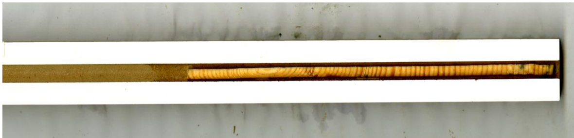
Figure 1. Scanning image of tree ring widths.

The winDENDRO software was used to measure the increment cores. First, the increment cores were scanned with a high-resolution scanner, and the images were saved in "tif" format at 600 dpi. The images were then processed in the winDENDRO software to determine the width of the annual rings and the ages of the trees. The scanning image of one of the sampled trees core is presented in Figure 1.