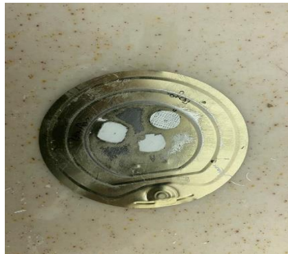
Figure 2. Adhesion analysis experiment set.

Table 6. Our dye samples (0) showed excellent adhesion by roasting.