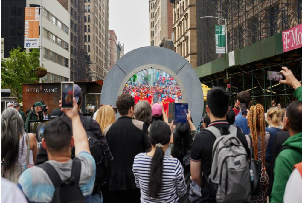
Figure 5. Portal Project, New York, 2024

it creates a democratic space where people can easily interact. In addition, this sculpture transforms the spatial setup into a stage where a theatrical show is watched and performed in the public space (Figure 5).