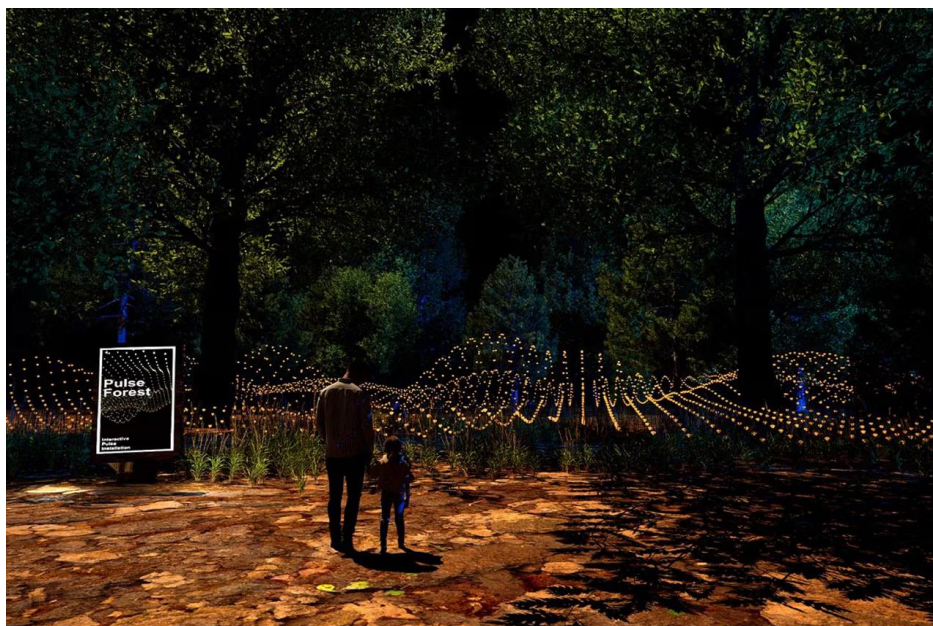
Figure 2. Rafael Lozano-Hemmer, Listening Forest , (2023).

Artist Trevor Paglen, who works on issues such as surveillance systems, privacy, secret state operations, and digital technologies, focuses on using digital maps, satellite imagery, and big data in the public sphere in his works.