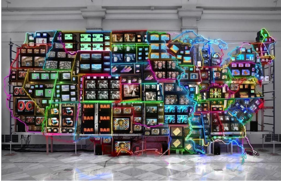
Figure 1. Nam June Paik, Electronic Superhighway: Continental U.S., Alaska, Hawaii , 1995, fifty-one channel video installation (including one closed-circuit television feed), custom electronics, neon lighting, steel, and wood; color, sound, approx. 15x 40 x 4 ft., Smithsonian American Art Museum.