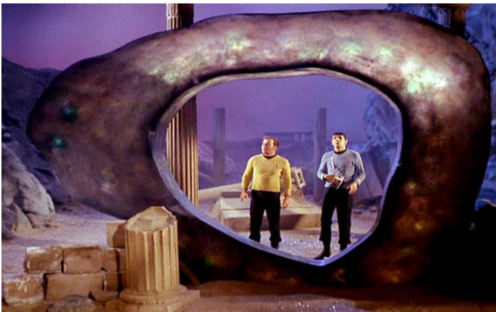
Figure 3. Star Trek 1. Season-28. Episode, The City on the Edge of Forever , Screenshot

For example, according to Harlan Ellison, screenwriter of the science fiction series Star Trek , the episode The City on the Edge of Forever tells a story about the crew of the USS Enterprise, which includes themes of time travel and alternate reality. The story begins with the crew discovering the Infinity Machine , a time portal (Figure 3). This portal allows you to reach different time zones using time and space as a transition point. Captain Kirk and his crew get stuck in this period when Dr. McCoy accidentally travels to the 1930s. However, Dr. McCoy's intervention changes history and leads to a future event not occurring. Captain Kirk and Mr. Spock try to go back in time and restore history to correct this mistake. This chapter presents a fascinating story that includes alternate reality, time paradoxes, and profound reflections on human destiny (Ellison, 1967).