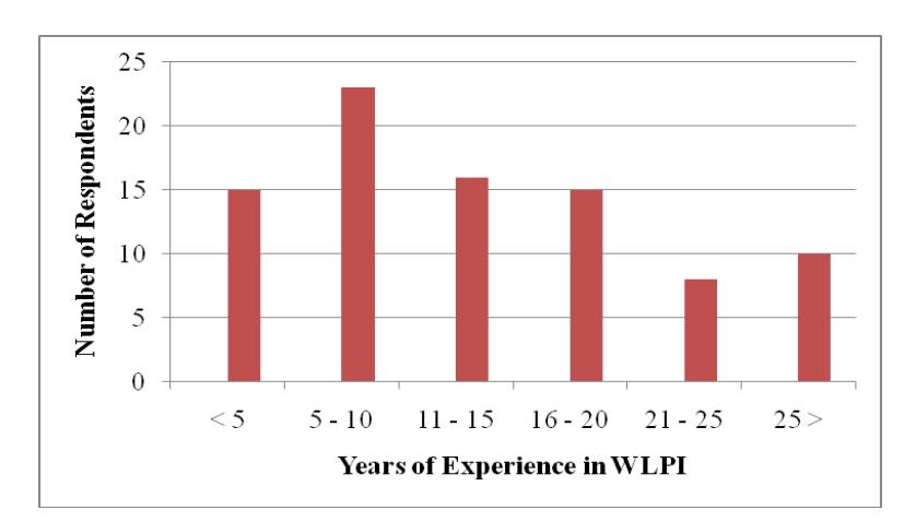
Figure 1: Years of Experience in WLPI

10 years, and more than 10 years, nearly 56.4% (n=49) had more than 10 years of experience in WLPI.