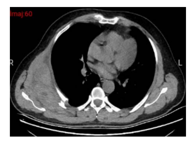
Figure 1: Rib fracture and hematoma on the right serratus anterior muscle.